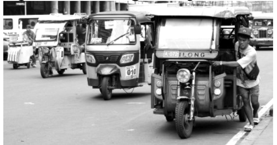
BANNED FROM MAJOR ROADS. Electric tricycles (e-trikes) pass along the shopping district of Divisoria in Manila in this photo taken on Nov. 28, 2025. E-trikes are banned from major roads in the National Capital Region beginning Friday (Jan. 2, 2026), as part of government efforts to uphold road safety.