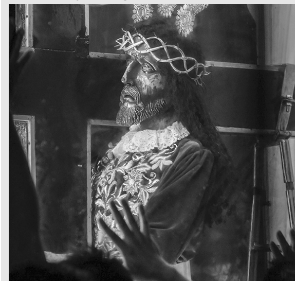
The image of Jesus Nazareno during the Traslacion on Jan. 9, 2025.

Ahead of the annual Jan. 9 Traslacion, Quiapo Church will hold a thanksgiving procession of the image of Jesus Nazareno on the evening of Dec. 30 as part of preparations for the major religious event.