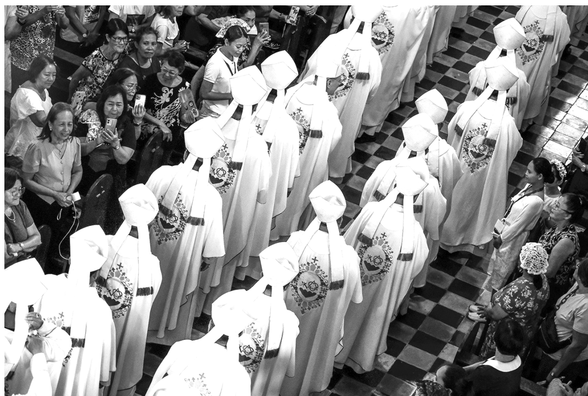
Bishops process at the start of Mass at Baclayon Church in Bohol province on July 2, 2025.