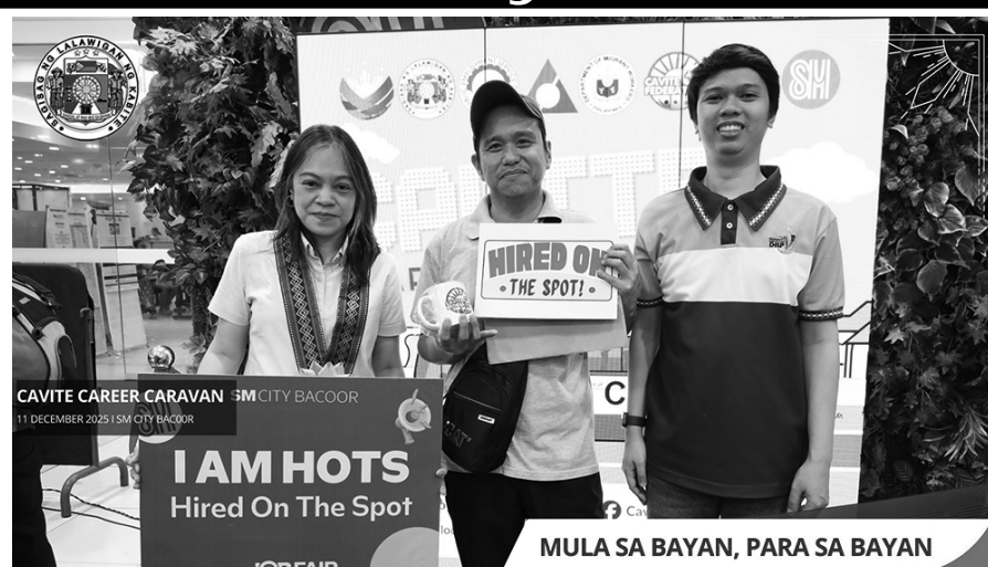
MULA SA BAYAN, PARA SA BAYAN

several national government agencies were present to extend on-site assistance and information to applicants. These included Department of Trade and Industry (DTI), Technical Education and