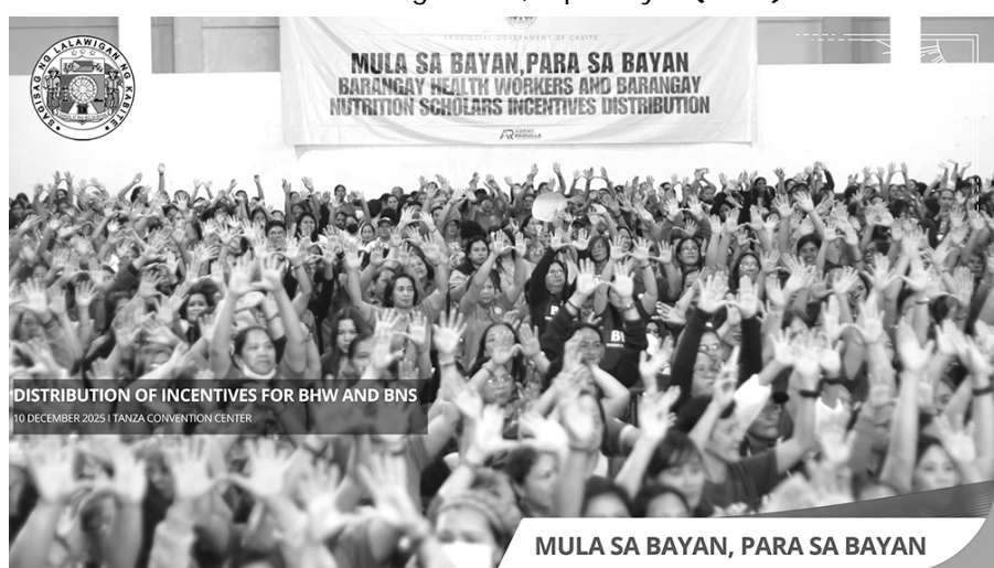
DISTRIBUTION OF INCENTIVES FOR BHW AND BNS 10 DECEMBER 2025 | TANZA CONVENTION CENTER

The activity highlighted the Provincial Government's steadfast support for its health workforce, reaffirming that the dedication and sacrifices of BHWs and BNS remain a cornerstone of effective and responsive community healthcare in Cavite. (PIO)