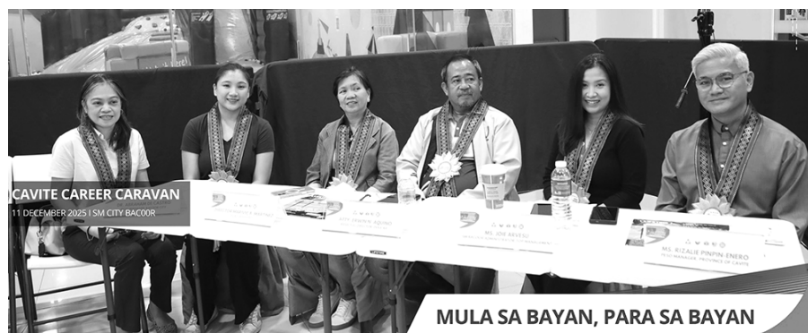
MULA SA BAYAN, PARA SA BAYAN

The Cavite Career Caravan organized by the Office of the Provincial Public Employment Service Manager was successfully conducted at SM City Bacoor on December 11, in line with the celebration of the 92nd Anniversary of the Department of Labor and Employment (DOLE). The activity provided a valuable platform for jobseekers to explore employment opportunities and access government services in one convenient venue.