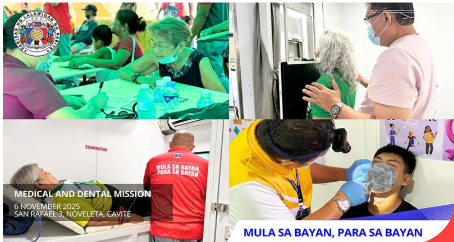
MEDICAL AND DENTAL MISSION 6 NOVEMBER 2025 SAN RAFAEL 3, NOVELETA, CAVITE