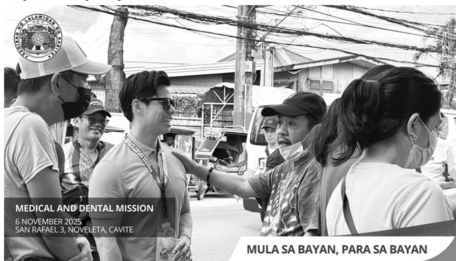
MEDICAL AND DENTAL MISSION 6 NOVEMBER 2025 SAN RAFAEL 3, NOVELETA, CAVITE

program, wherein they availed various free health services such as ECG for 23 patients, X-ray for 10 recipients, and dental services for 58 beneficiaries. Through these sustained efforts, the province continues to promote the well-being of its constituents and ensure that quality healthcare remains accessible to all. (F. Tamio)