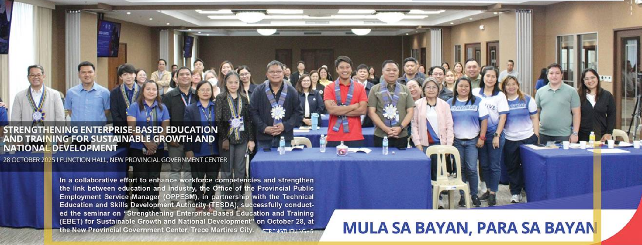
STRENGTHENING ENTERPRISE-BASED EDUCATION AND TRAINING FOR SUSTAINABLE GROWTH AND NATIONAL DEVELOPMENT 28 OCTOBER 2025 | FUNCTION HALL, NEW PROVINCIAL GOVERNMENT CENTER

In a collaborative effort to enhance workforce competencies and strengthen the link between education and industry, the Office of the Provincial Public Employment Service Manager (OPPEM), in partnership with the Technical Education and Skills Development Authority (TESDA), successfully conducted the seminar on "Strengthening Enterprise-Based Education and Training (EBET) for Sustainable Growth and National Development" on October 28, at the New Provincial Government Center, Trece Martires City. STRENGTHENING • 5