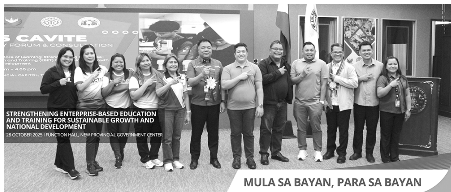
MULA SA BAYAN, PARA SA BAYAN