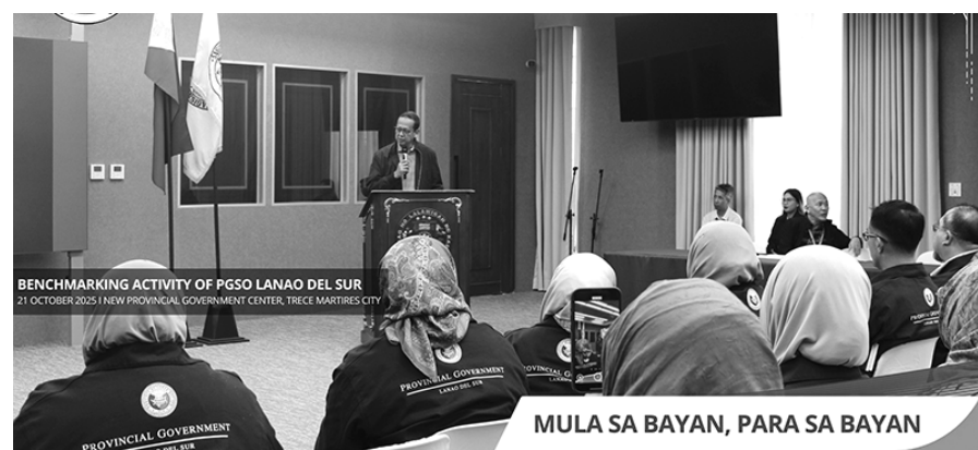
MULA SA BAYAN, PARA SA BAYAN

Through the benchmarking initiative, both provinces reaffirmed their shared commitment to promoting good governance, transparency, and innovation in public service operations. (JDP)