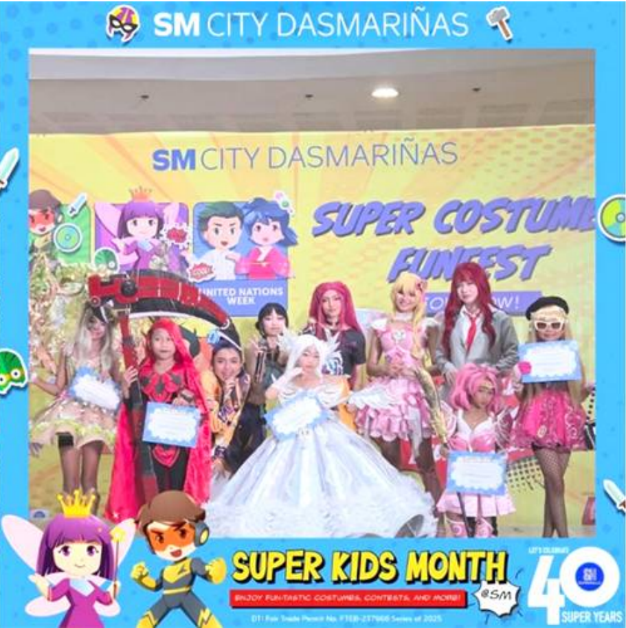
Little Cosplayers Unite at SM City Trece and Dasma! In celebration of Kids' Month, young cosplayers stole the show at the Cosplay Conquest in SM City Trece Martires and SM City Dasmariñas! From mini superheroes to adorable anime icons, these kids showcased their creativity, confidence, and love for cosplay—proving that even the youngest fans can conquer the stage with style and heart.