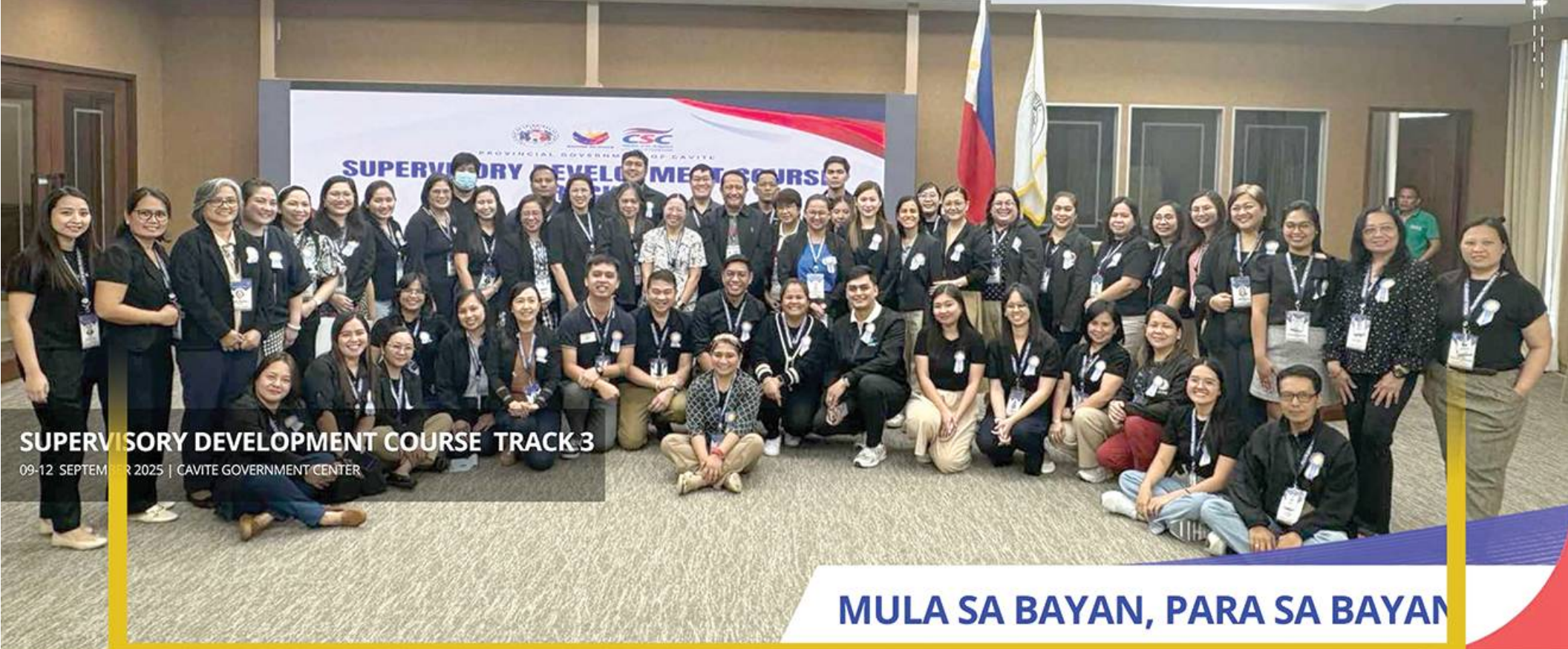
SUPERVISORY DEVELOPMENT COURSE TRACK 3 09-12 SEPTEMBER 2025 | CAVITE GOVERNMENT CENTER