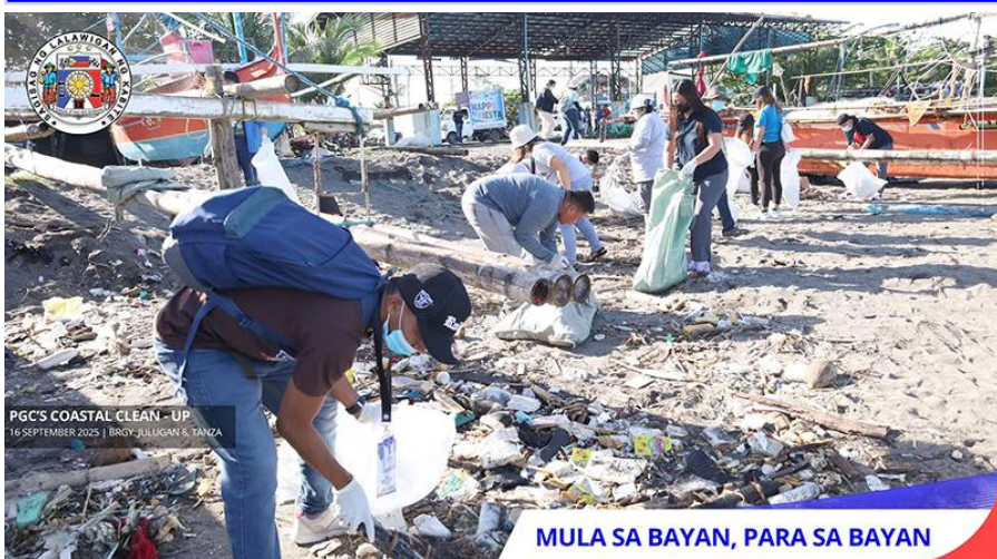
PGC'S COASTAL CLEAN-UP 16 SEPTEMBER 2025 | BIRGY JULUGAN 8, TANZA