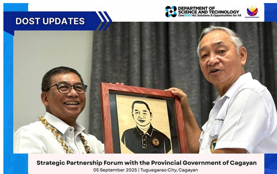
Strategic Partnership Forum with the Provincial Government of Cagayan 05 September 2025 | Tuguegarao City, Cagayan

On September 5, 2025, Department of Science and Technology (DOST) Secretary Renato U. Solidum, Jr. led the agency's delegation to the Strategic Partnership Forum with the Provincial Government of Cagayan, where they were warmly welcomed by Governor Edgar B. Aglipay.