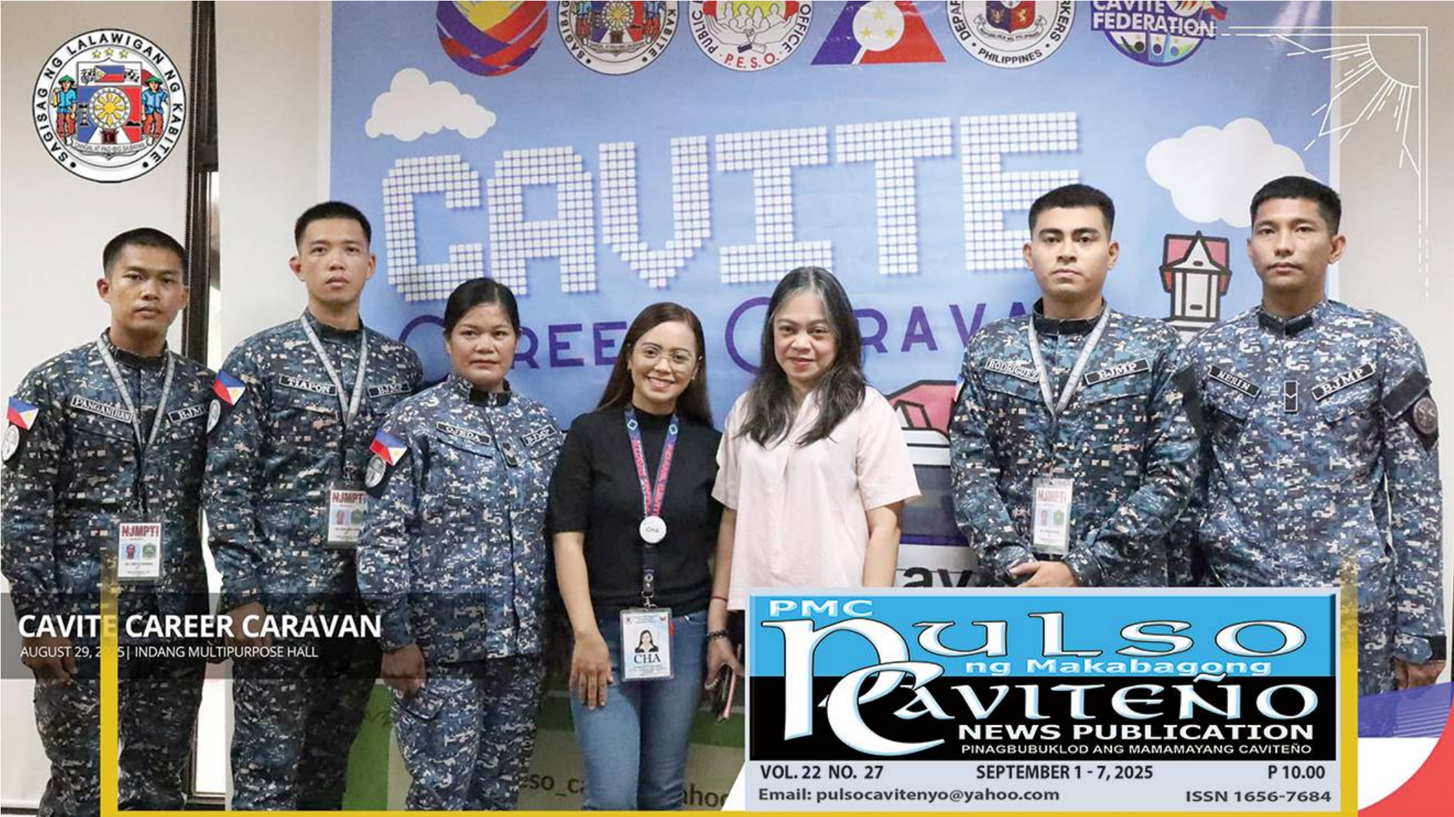
CAVITE CAREER CARAVAN AUGUST 29, 2025 | INDANG MULTIPURPOSE HALL