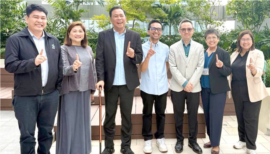
On August 4–6, our two Assistant Regional Directors and one Provincial Director participated in the Seminar on Settlement of Accounts and COA Procedures at Grand Westside Hotel, Parañaque City. The seminar provided a comprehensive understanding of financial account settlement and Commission on Audit (COA)

The staff of DOST Northern Mindanao continue to enhance their skills to deliver exceptional service to clients. Just last week, they engaged in a series of capacity-building sessions aimed at strengthening expertise, improving efficiency, and ensuring that the agency’s operations remain client-centered.