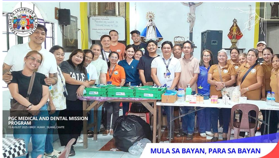
PGC MEDICAL AND DENTAL MISSION PROGRAM 15 AUGUST 2025 | BRGY. HUKAY, SILANG, CAVITE