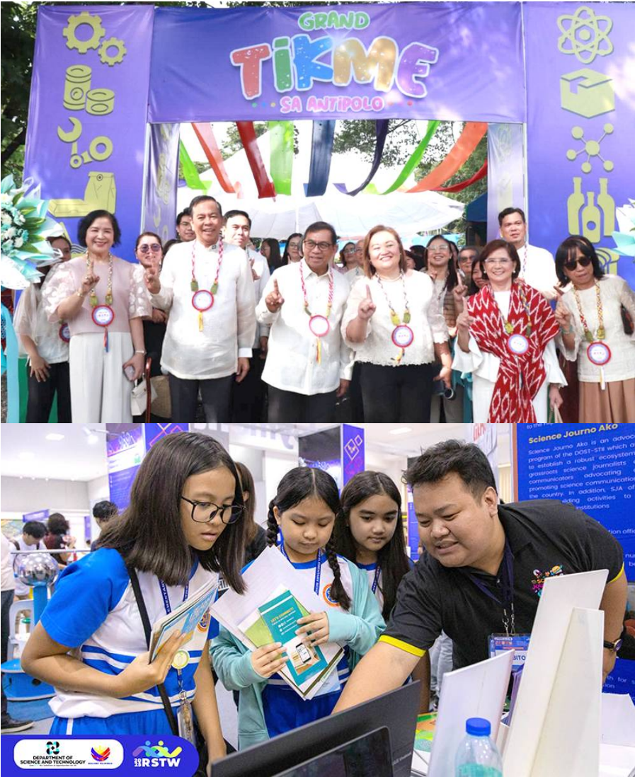
ANTIPOLLO CITY, Rizal – The Department of Science and Technology - CALABARZON (DOST-CALABARZON) formally opened the Regional Science, Technology, and Innovation Week (RSTW) 2025 on August 14 at the Ynares Events Center, Antipolo City, with the theme “Building Smart and Sustainable Communities.” The three-day celebration, which runs until August 16, showcases how science, technology, and innovation (STI) can drive inclusive development and strengthen community resilience in the region and beyond.