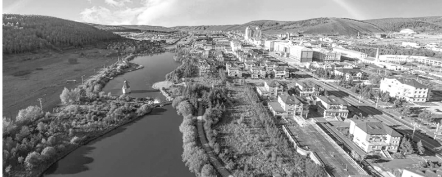
Photo shows cityscape of Arxan, Xing'an league, north China's Inner Mongolia autonomous region.

Tucked away in the northwestern corner of Xing'an league in north China's Inner Mongolia autonomous region, Arxan ranks among China's "tiniest city" by population - just 28,600 residents - yet exerts a disproportionate influence in tourism and cultural exchanges.