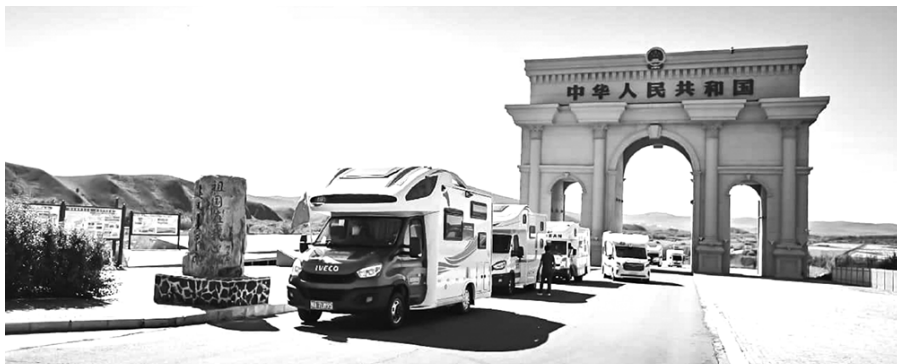
Photo shows a China-Mongolia border port in Arxan, Xing'an league, north China's Inner Mongolia autonomous region.

"The project's rebranding from coal to liquified natural gas (LNG), then back to coal, was widely seen as an attempt to exploit regulatory gaps, circumvent requirements, and sneak its way to construction and operation. Sec. Sharon Garin is grossly misinformed in her support for the project. Her predecessor was sued for bending the coal moratorium just to allow the A1E coal plant. She must not commit the same mistake. The coal moratorium provides her the unmistakable mandate of once and for all shelving the project," Pedrosa stressed. #EndCoal #NoToLNG #PhaseoutFossilFuels #ClimateJusticeNow #QuezonForEnvironment #QuezonForClimateJustice #KAPAKANAN #LabanAtimonan