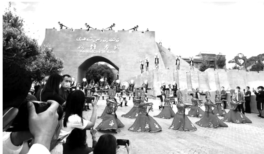
Performers dance outside the ancient city of Kashgar to welcome tourists.

Today, Kashgar stands as China's gateway to the west, an international corridor leading to Central, West, and South Asia, and the starting point of the China-Pakistan Economic Corridor. Departing from downtown Kashgar and heading south along the Karakoram Highway, known as the "China-Pakistan Friendship Road," one can reach Taxkorgan Tajik autonomous county after a 300-kilometer drive.