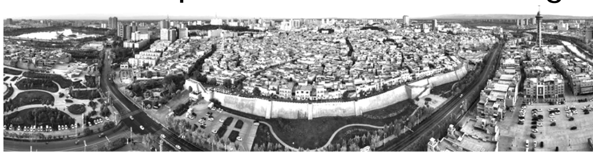
The ancient city of Kashgar.

Located in the southwestern part of Xinjiang Uygur autonomous region, Kashgar sits on a lush oasis nourished by the Yarkant River, which flows from the Karakoram Mountains. Since ancient times, traders and travelers crossing the Pamir Plateau have stopped here to rest, trade, and connect. This made Kashgar a key hub along the ancient Silk Road and one of Xinjiang's earliest international trading posts. Historical figures such as Zhang Qian, Xuanzang, Faxian, and Marco Polo all left their footprints in this storied land.