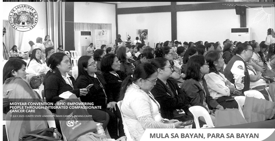
MULA SA BAYAN, PARA SA BAYAN

The initiative served as a platform for shared knowledge and practices for diverse groups of Cavite health professionals and barangay health workers in combating cancer through integrated treatment and care.