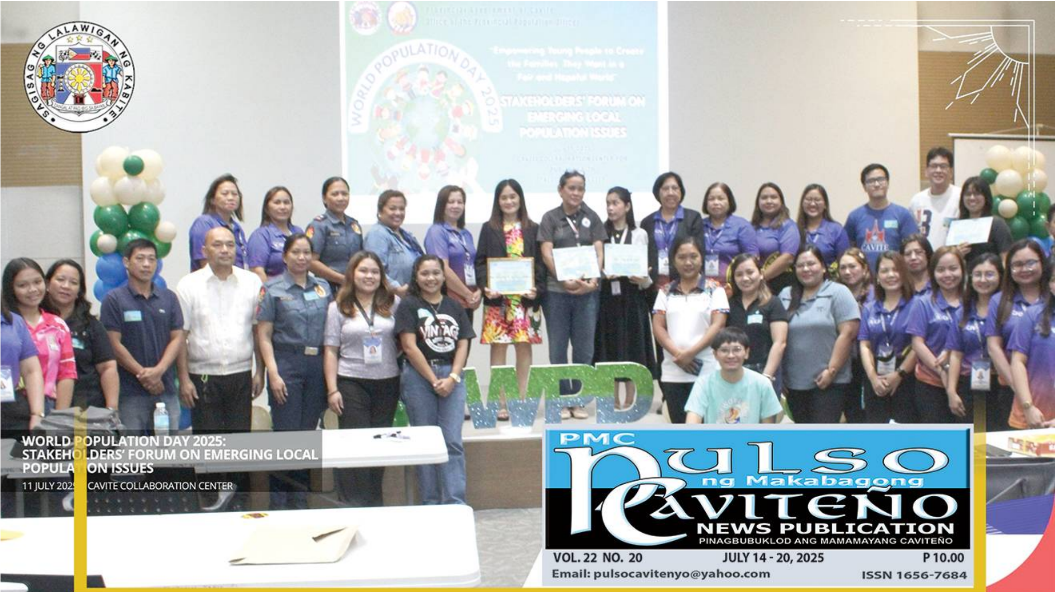
WORLD POPULATION DAY 2025: STAKEHOLDERS' FORUM ON EMERGING LOCAL POPULATION ISSUES

11 JULY 2025 CAVITE COLLABORATION CENTER