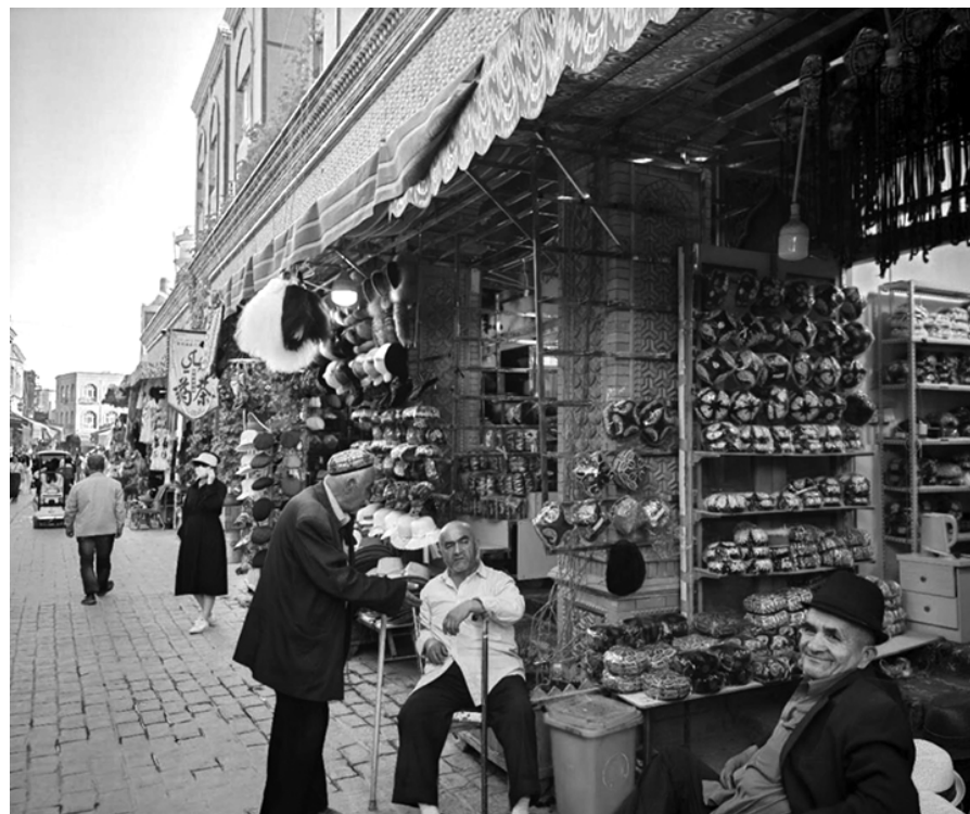
Photo shows a street in the ancient city of Kashgar.

As the business grows, securing a steady supply of coffee beans has become a top priority. "When we first started, we would bring beans back with us during family visits to Tanzania. Now, they're shipped via a more stable route - from Africa to Europe, then to Kashgar by China-Europe freight trains," he explained.