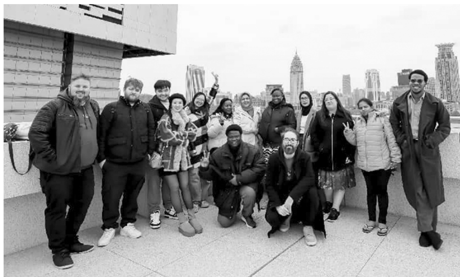
Online novelists from various countries pose for a picture during the third Shanghai International Online Literature Week in Shanghai.

spin-offs and adaptations. "In South Korea, many learn about Chinese web novels through TV shows or animations, then return to the original works. That adaptation cycle - how it loops back to the source - is something quite unique," Park explained. (By Zhang Bolan, Zhao Yipu, Mang Jiuchen, People's Daily )