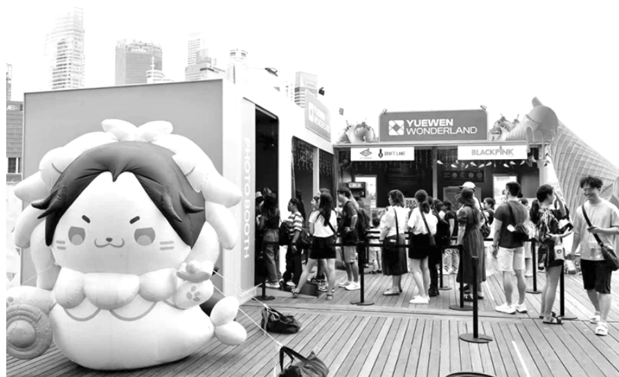
An exhibition on Chinese online literature and related products is held in Singapore, attracting many local visitors.