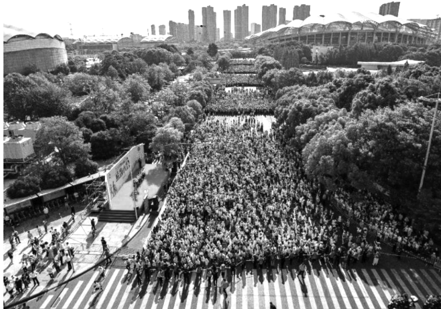
The 15th Kunshan Hiking Event takes place in Kunshan, Suzhou, east China's Jiangsu province.

During this year's May Day holiday, outdoor sports and travel captured wide public interest and participation across China.