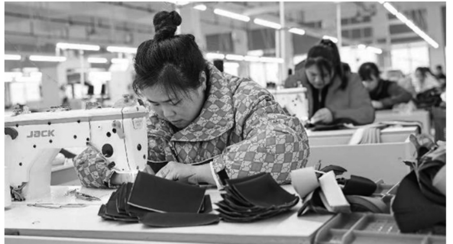
The 15th Kunshan Hiking Event takes place in Kunshan, Suzhou, east China's Jiangsu province.

China is steadily promoting the development of outdoor sports destinations to ensure the timely achievement of its goal to build around 100 high-quality outdoor sports destinations by 2030. With its vast territory and spectacular landscapes, the country is well-positioned to leverage its world-class natural resources in this endeavor.