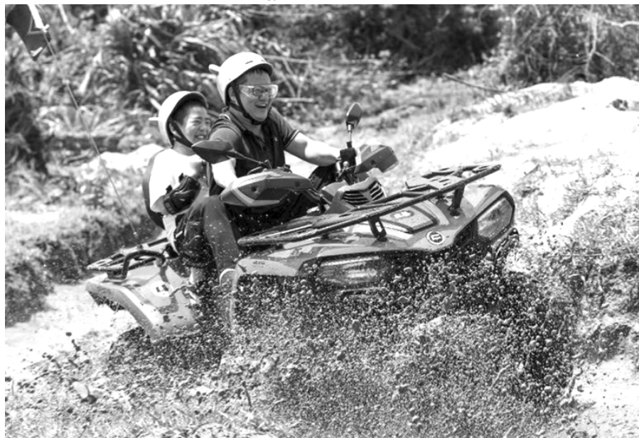
The 15th Kunshan Hiking Event takes place in Kunshan, Suzhou, east China's Jiangsu province.

By turning "small sports" into "big industries," and combining proactive government support with dynamic market mechanisms, China is turning innovative concepts into tangible benefits. (By Zhou Renjie, People's Daily)