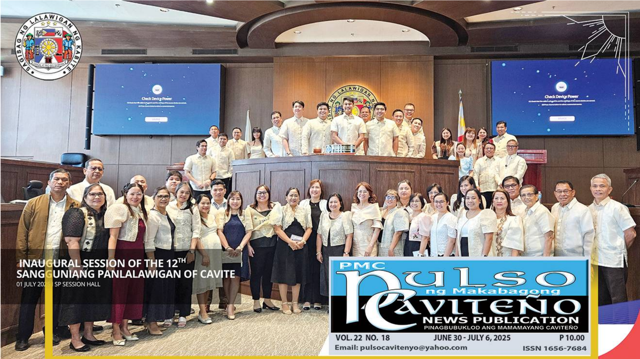
INAUGURAL SESSION OF THE 12 TH SANGGUNIANG PANLALAWIGAN OF CAVITE 01 JULY 2025 | SP SESSION HALL