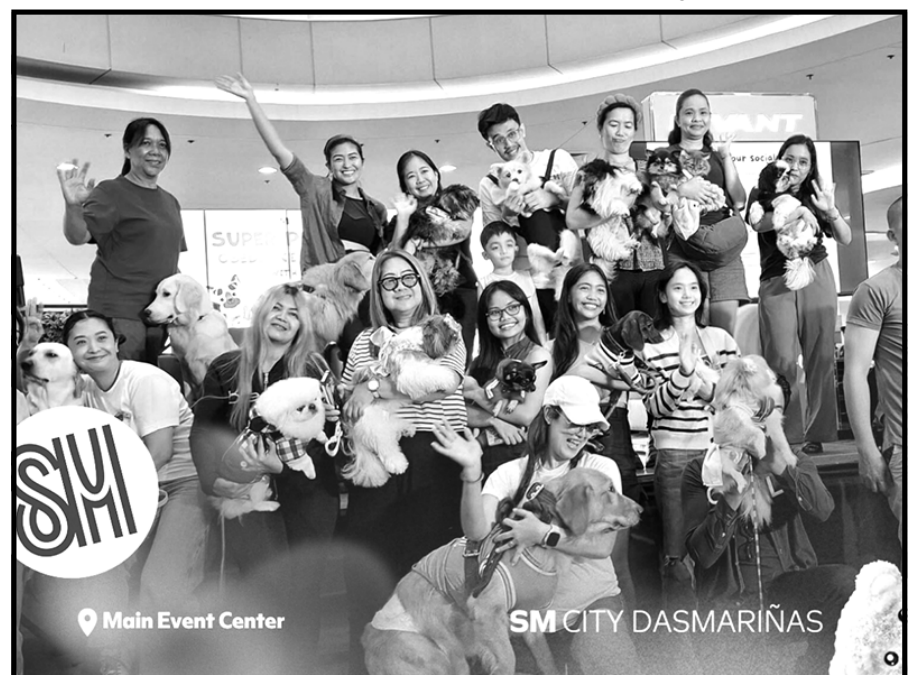
SM City Dasmariñas went full tail-wag mode during the Super Pets Academy: Obedience Training Caravan last June 21! Fur babies showed off their smarts, skills, and sass—earning treats and tail wags all day long! Want more paw-some moments like this? Join the pack on Facebook! www.facebook.com/groups/smsuperpetsclub