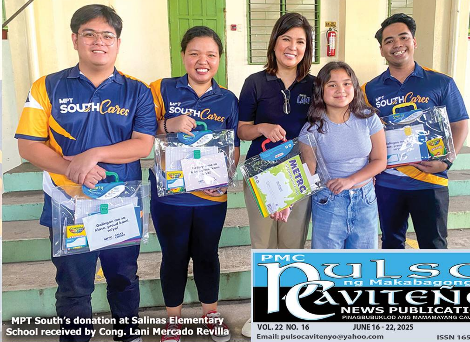
MPT South's donation at Salinas Elementary School received by Cong. Lani Mercado Revilla

PMC pulsocaviteño ng Makabagong NEWS PUBLICATION PINAGBUBUKLOD ANG MAMAMAYANG CAVITEÑO VOL. 22 NO. 16 JUNE 16 - 22, 2025 P 10.00 Email: pulsocavitenyo@yahoo.com ISSN 1656-7684