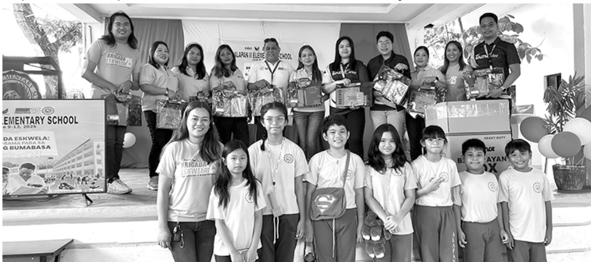
Alapan II-A Elementary School receives school kits from MPT South

About MPT South MPT South is a subsidiary of Metro Pacific Tollways Corporation (MPTC). Aside from CALAX and CAVITEX networks of toll roads, MPTC's domestic portfolio includes concessions for the North Luzon Expressway (NLEX), the NLEX Connector Road, the Subic-Clark-Tarlac Expressway (SCTEX), and the Cebu-Cordova Link Expressway (CCLEX) in Cebu.