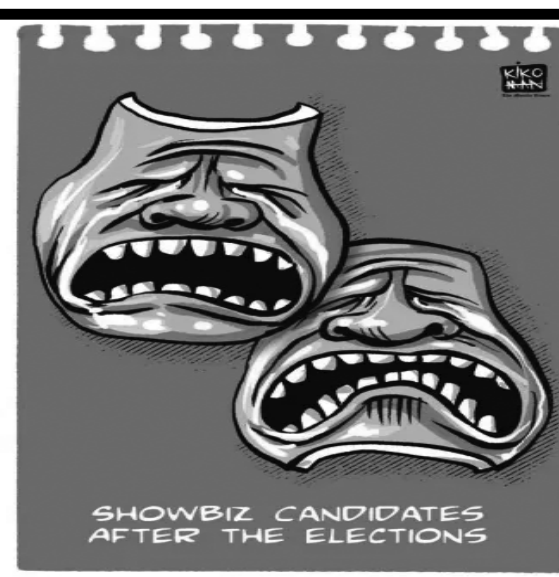
SHOWBIZ CANDIDATES AFTER THE ELECTIONS

Indonesia slash barriers, hesitation or any delay risks relegating the Philippines to irrelevance."