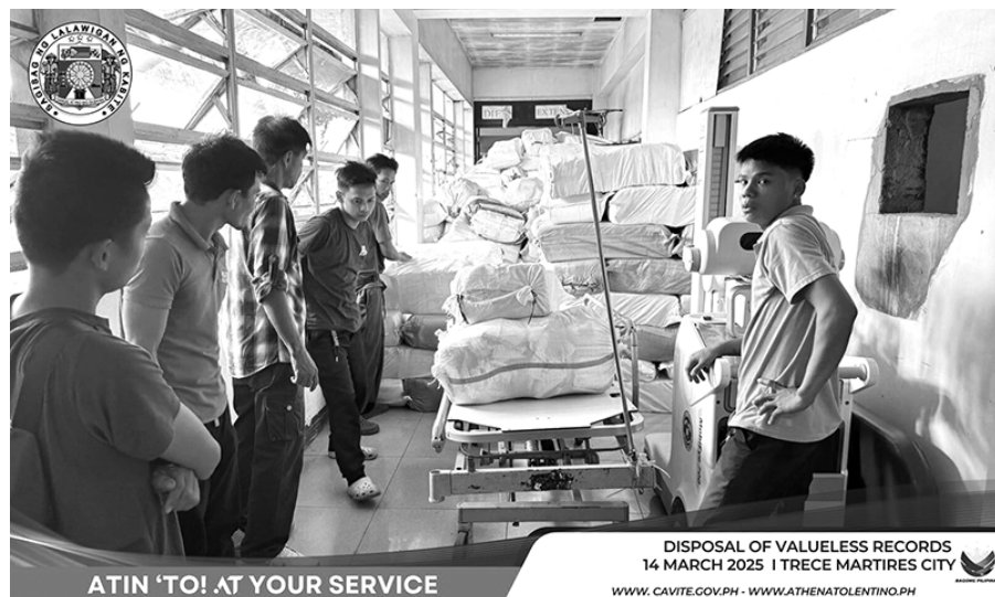
ATIN 'TO! AT YOUR SERVICE