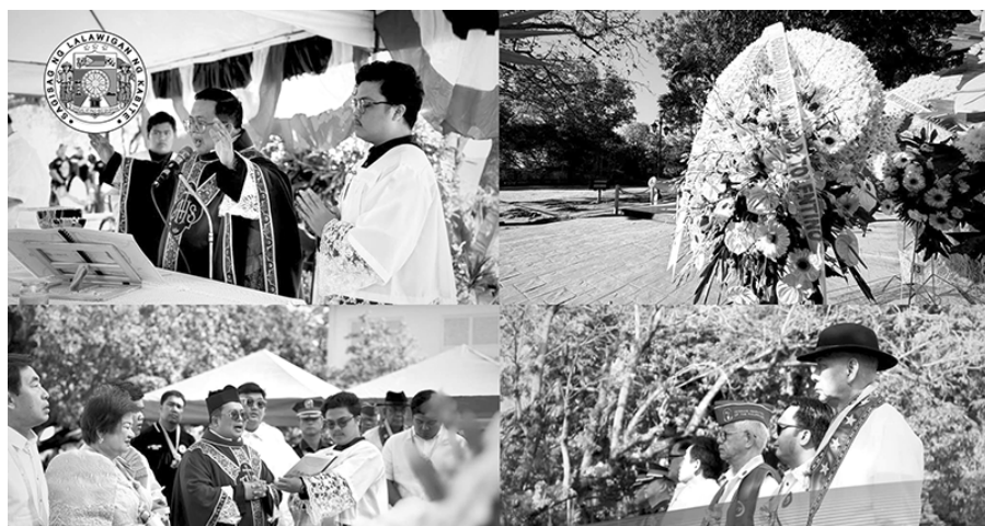
ATIN 'TO! AT YOUR SERVICE

contributions to Philippine history, particularly his leadership in the fight for independence. The attendees reaffirmed their commitment to preserving and promoting his legacy for future generations. The provincial government of Cavite continues to uphold its role in keeping the memory of its esteemed hero alive, ensuring that his patriotism and dedication to the nation remain an inspiration to all Filipinos. (OPIO)