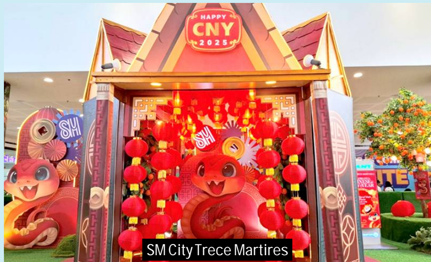
SM City Trece Martires