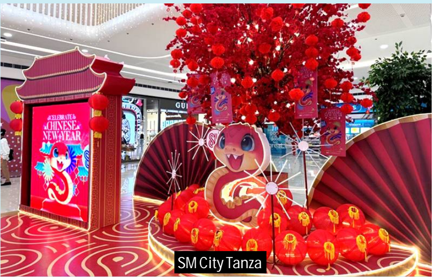
SM City Tanza