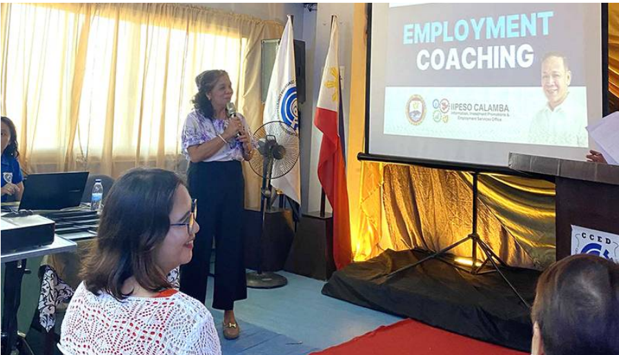
The seminar was participated by a total of sixty-five (65) students from different qualifications, specifically in Food and Beverage Services, Events Management Services, Housekeeping, and Bookkeeping under the Technical Education and Skills Development Authority.

The Department of Trade and Industry (DTI) – Laguna Provincial Office, in collaboration with the Center for Competencies Enhancement and Development (CCED), successfully conducted a seminar titled “Em-employment/Job Coaching Seminar” on January 17, 2025 at the 3rd Floor Kristine Business Center, Calamba City Hall, Brgy. II (Poblacion), Calamba City, Laguna.