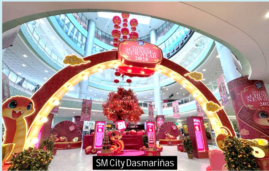
SM City Dasmariñas

SM Malls in Cavite celebrate the Lunar New Year with stunning CNY centerpieces that bring authentic Chinese vibes to the festive atmosphere. From SM City Dasmariñas to SM City Trece Martires, SM City Rosario, and SM City Tanza, the spirit of joy, prosperity, and good fortune fills the air this Year of the Snake!