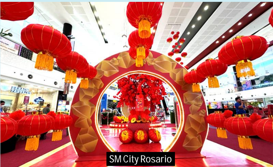
SM City Rosario