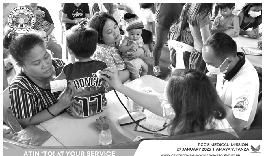
ATIN 'TO! AT YOUR SERVICE

The medical mission is another testament to the Provincial Government's commitment to improving the well-being of its constituents by delivering accessible and quality healthcare straight to communities.