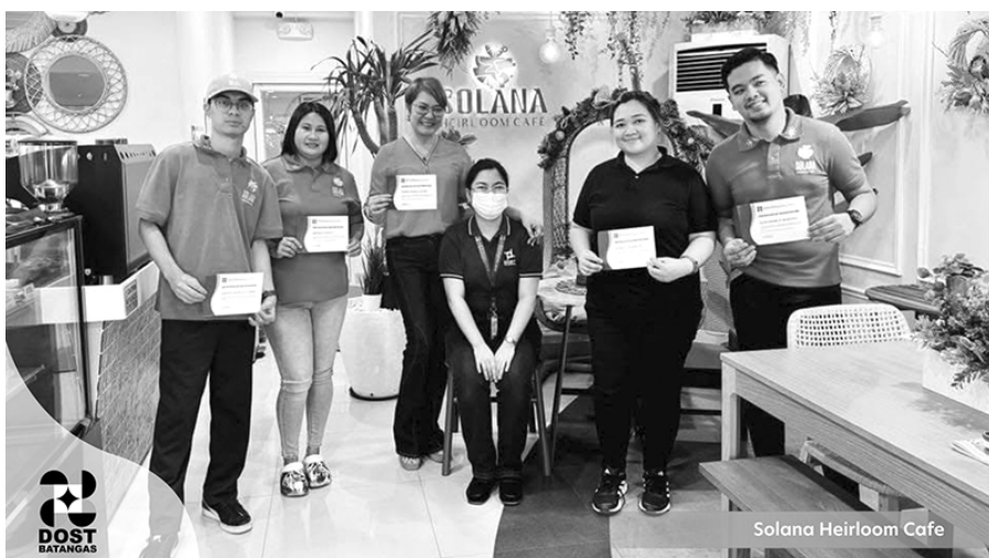
Solana Heirloom Cafe

The training aimed to not only improve their knowledge of food safety standards but also to empower them with the skills to improve their operational efficiency. Through this initiative, DOST-Batangas also hopes to foster a culture of food safety and sustainability within the local MSME sector and help these businesses remain competitive in the market. Moreover, the training emphasized the importance of continuous monitoring and assessment to ensure the long-term success of food safety practices.