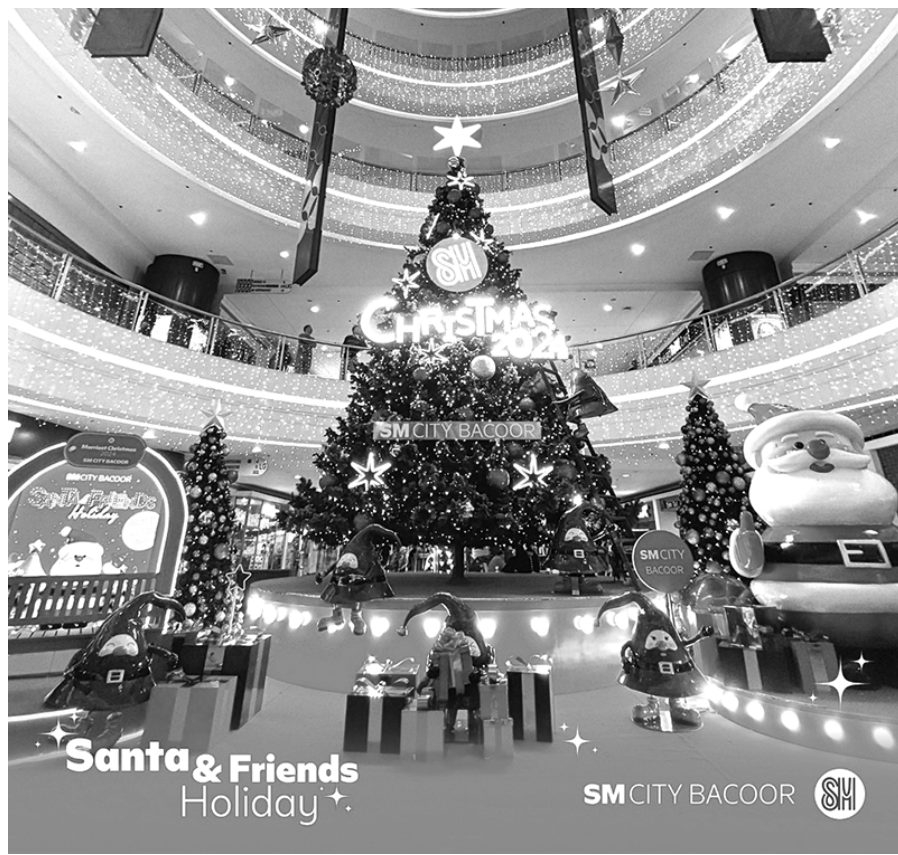
Santa & Friends' Holiday at SM City Bacoor: The holiday magic begins as SM City Bacoor unveils and lights up its enchanting 'Santa and Friends' Christmas Centerpiece. This festive display features a majestic 30ft Christmas Tree, adorable life-sized elves, and huge presents, bringing joy and holiday cheer to all shoppers. Special guests from Gov. PF Espiritu Elementary School in Bacoor were also present and were thrilled to receive SM Bears of Joy.