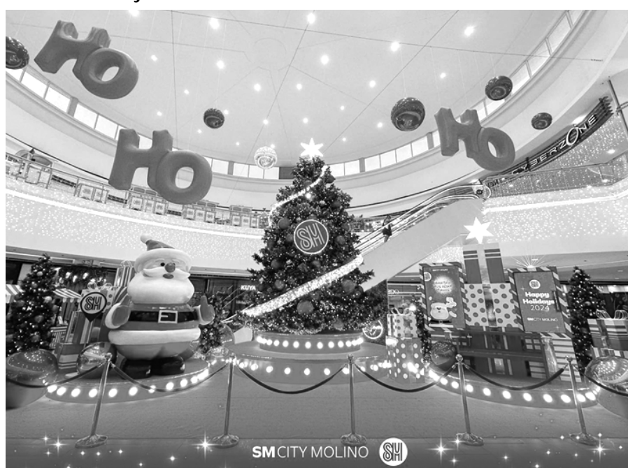
Santa's Holiday Magic at SM City Molino: The magic of Christmas has officially arrived at SM City Molino as Santa's Holiday Magic beautifully lights up the mall's Event Center, bringing more festivity with its 25ft tall Christmas tree and Giant Santa. This year, children from the Malipay Community joined in the celebration and shared in the spirit of giving as they cheerfully received their Bears of Joy. The event was made even more special with happy and festive performances by the Raz Singing Cherubim.