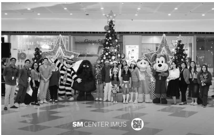
Santa's Gift Hub at SM Center Imus: SM Center Imus transformed into a holiday haven with its Santa's Gift Hub, officially launched with a tree lighting ceremony at the Mall Plaza. The mall offered a one-stop gift shop, holiday workshops, and exciting promotions. The Raz Singing Cherubim shared a wonderful rendition of Christmas carols to the shoppers and made the celebration merrier.

Visit SM City Bacoor, SM City Molino, and SM Center Imus for a holly-jolly Christmas!