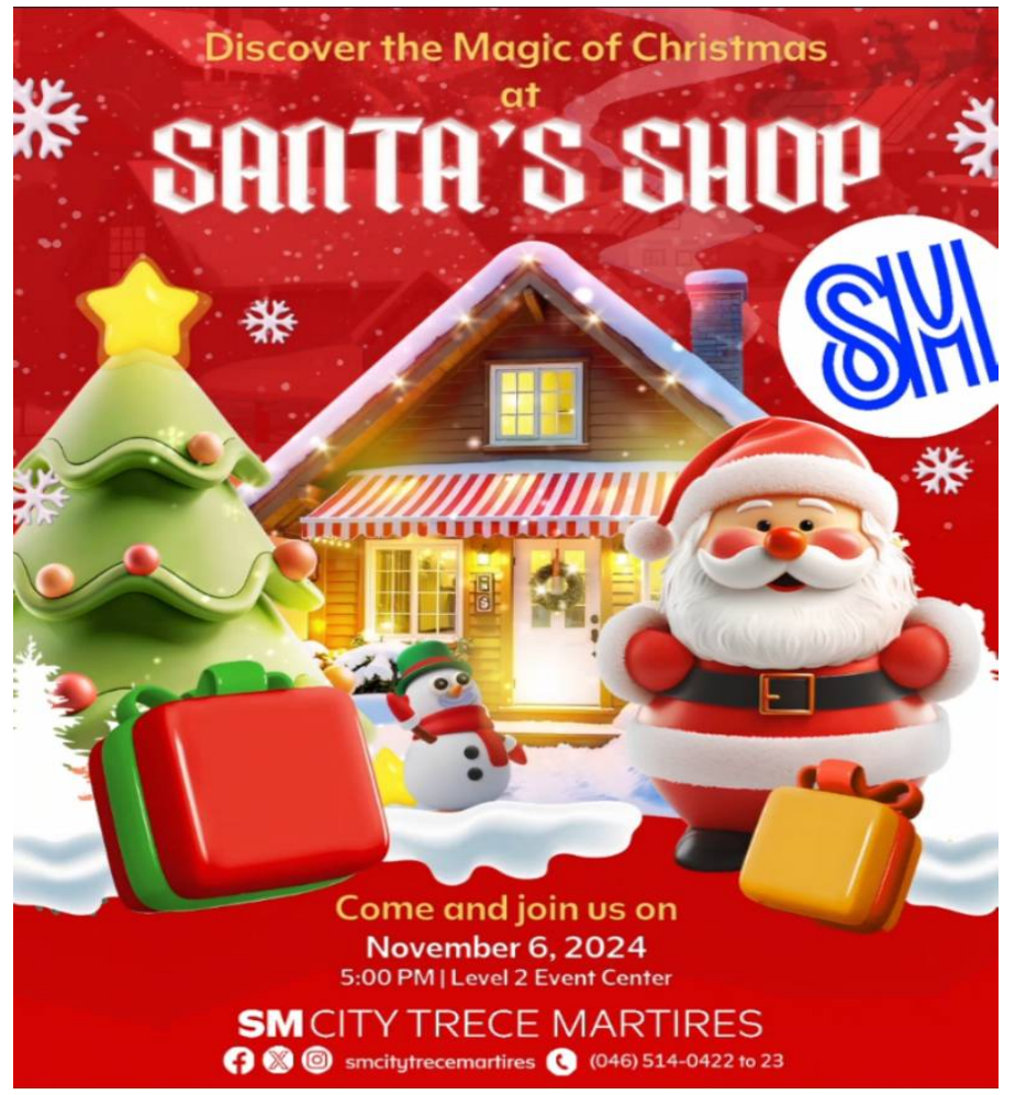
Step into the Magic of Christmas at Santa's Shop! Join us as we kick off the holiday season on November 6, 2024, at 5PM, SM City Trece Martires! Whether you're on Santa's nice list or just looking for some holiday cheer, Santa's Shop has something for everyone.

With an expected combined surge in traffic volume across its expressways — NLEX, SCTEX, NLEX Connector, CALAX, and CCLEX — the MPTC Group is ready to assist motorists through its increased personnel deployment, 24/7 traffic condition monitoring and incident response, and enhanced traffic management measures to guide motorists. MPTC • 6