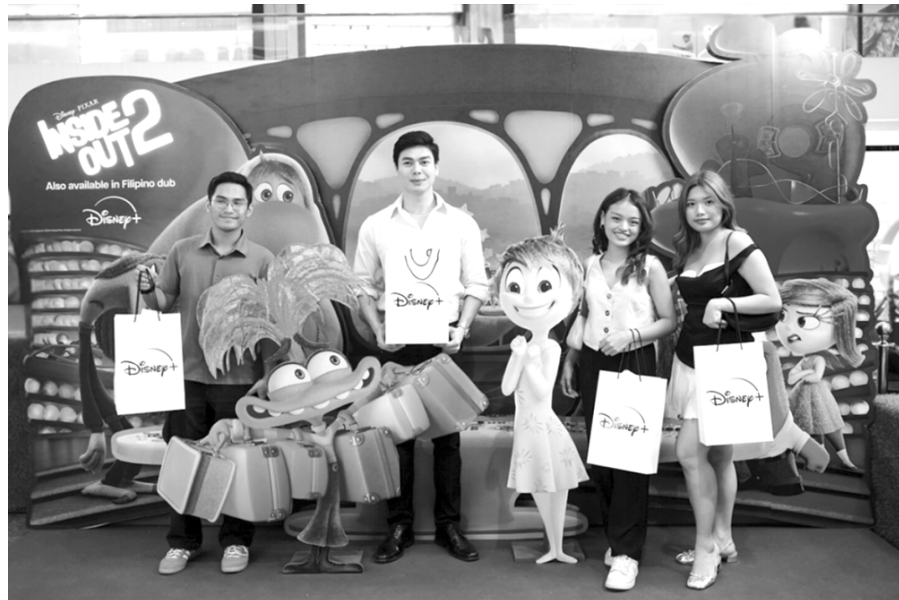
Cebuanos attend the "Inside Out 2" activation at SM Seaside City Cebu.

Fans of the beloved Disney and Pixar film "Inside Out 2" had the opportunity to create lasting memories with their favorite characters at SM Supermalls. Joy and Sadness, the iconic duo from the film's original five-personified emotions (the others being Anger, Fear, and Disgust), made special appearances at SM Seaside City Cebu on October 3, SM City North EDSA on October 5, and SM City Dasmariñas on October 6.