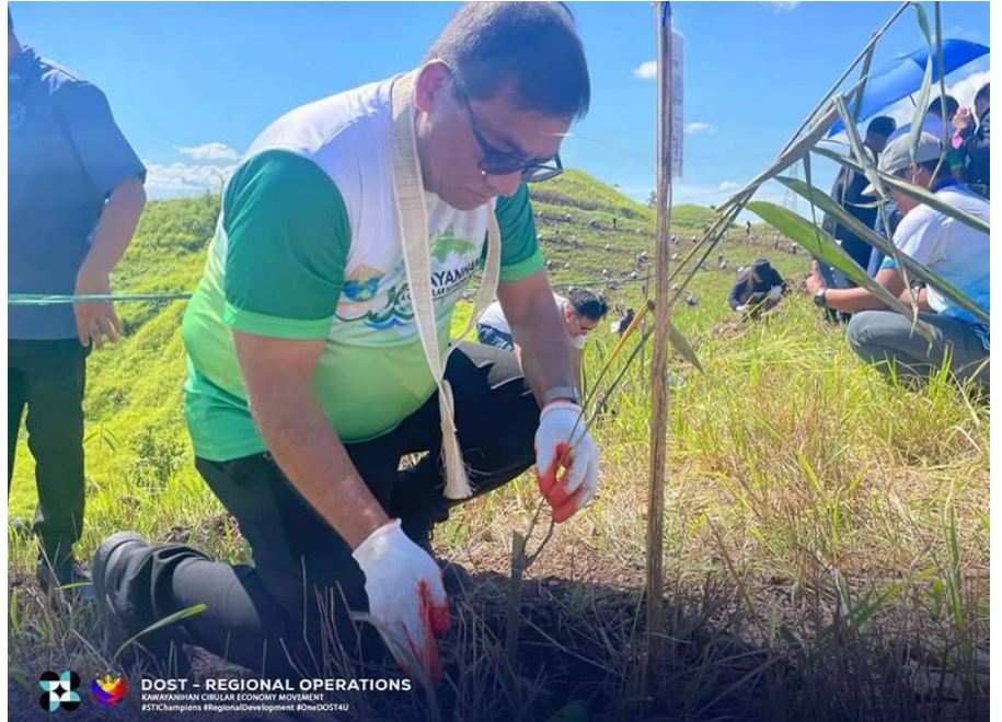
DOST Sec. Renato U Solidum, Jr the Disaster Boom Buster join Bamboo planting Record attempt demonstrating the power of collaboration for a sustainable future #Bamboo4dWIN #bambooPower (DOSTRegionalOperations)