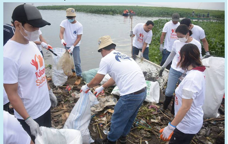
Volunteers from MPT South helping other volunteers to pick up waste by the coast.

Santa Rosa City, Laguna—On September 21, 2024, Metro Pacific Tollways South (MPT South), a subsidiary of the Metro Pacific Tollways Corp. (MPTC), actively participated in this year's International Coastal Cleanup held at the lakeside of Barangay Caingin, Santa Rosa City, Laguna. Teaming up with the Santa Rosa City Environment and Natural Resources Office (CENRO), 42 dedicated volunteers from various divisions of MPT South contributed to a successful day of environmental stewardship.