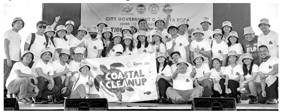
Volunteers from MPT South joined the International Coastal Cleanup 2024 at Sta. Rosa City, Laguna

MPT South is a subsidiary of Metro Pacific Tollways Corporation (MPTC), the infrastructure arm of Metro Pacific Investments Corporation (MPIC). Aside from the CALAX and CAVITEX networks of toll roads, MPTC's domestic portfolio includes concessions for the North Luzon Expressway (NLEX), the NLEX Connector Road, the Subic-Clark-Tarlac Expressway (SCTEX), and the Cebu-Cordova Link Expressway (CCLEX) in Cebu.