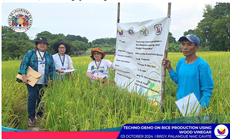
TECHNO-DEMO ON RICE PRODUCTION USING WOOD VINEGAR 03 OCTOBER 2024 | BRGY. PALANGUE NAIC CAVITE

The Office of the Provincial Agriculturist (OPA) assessed the Technology Demonstration project on Rice Production Using Wood Vinegar (Mokusaku) in Barangay Palangue, Naic, Cavite on October 3, 2024.