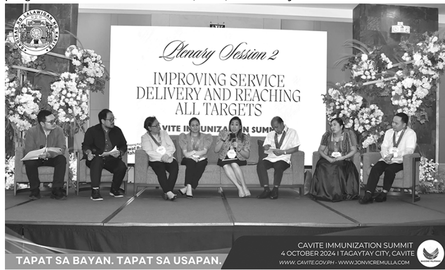
TAPAT SA BAYAN. TAPAT SA USAPAN.