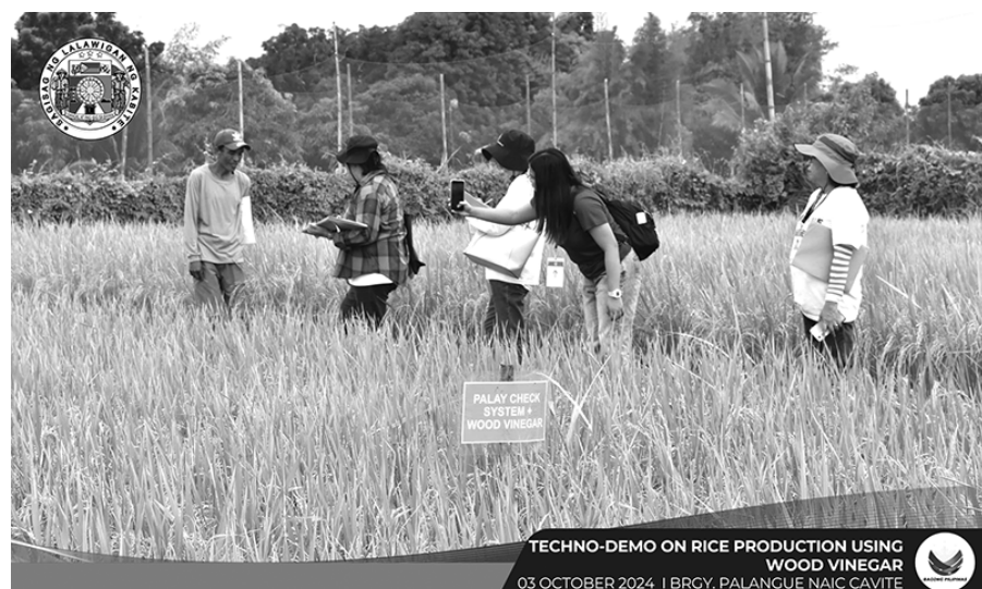
TECHNO-DEMO ON RICE PRODUCTION USING WOOD VINEGAR 03 OCTOBER 2024 | BRGY. PALANGUE NAIC CAVITE

OPA's ongoing efforts aim to refine these methods and encourage broader adoption of wood vinegar in rice farming across Cavite, marking a significant step toward improving agricultural productivity while protecting the environment. (R. Tanael)