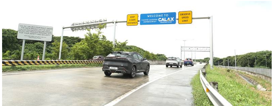
Biyaheng South Experiential Tour 2024 Convoy enters Cavite-Laguna Expressway

Metro Pacific Tollways South (MPT South), in partnership with the Department of Tourism (DOT) Region IV-A (CALABARZON) and Provincial Government of Cavite, held a successful Biyaheng South Experiential Tour 2024.