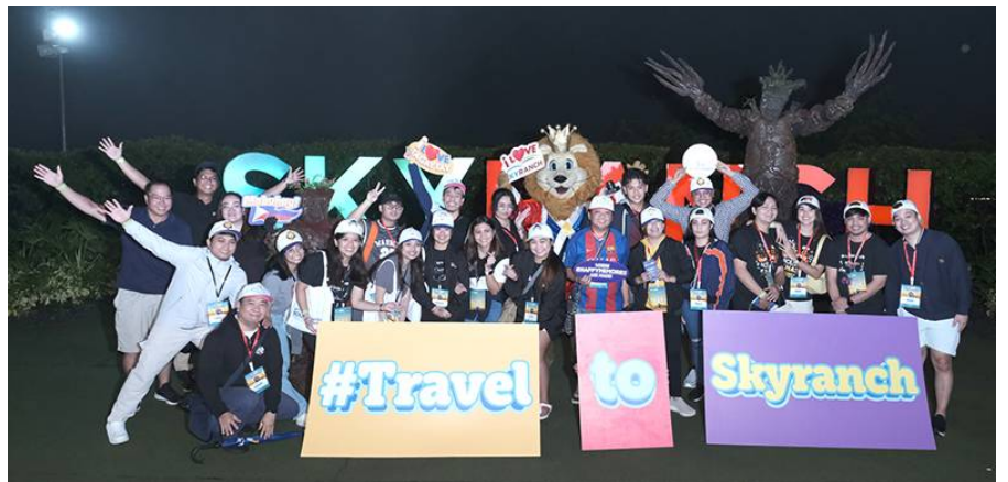
Biyaheng South Experiential Tour 2024 at Skyranch Tagaytay

This year's Experiential Tour was proudly co-presented by Taal Vista Hotel and DongFeng Motors PH, with generous sponsorship from World Balance, Sky Ranch Philippines, and Suteki Japanese Restaurant.