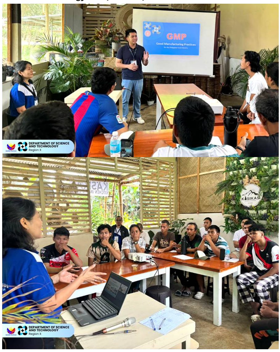
ULIRCO is a National Dairy Authority-supported group that produces pasteurized milk under the brand name "Fresh Moo" in Jasaan, Misamis Oriental. Fourteen staff and on-the-job trainees attended the training from DOST 10 on September 10, 2024. DOST TRAINS • 6

In its mission to enhance its production standards, the United Livestock Raisers Cooperative (ULIRCO) underwent training on Food Safety and Good Manufacturing Practices (GMP) from the Department of Science and Technology—10 (DOST 10).