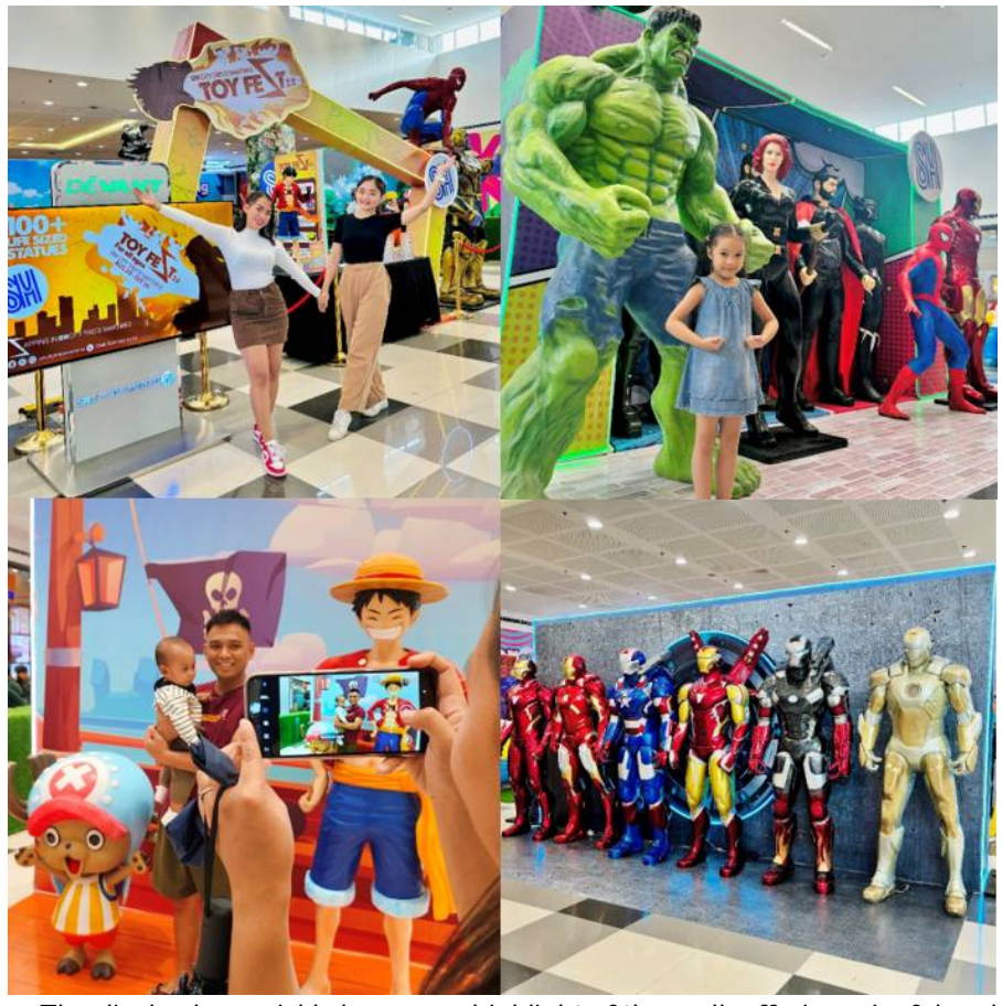
The display has quickly become a highlight of the mall, offering a joyful and engaging experience for everyone. Don't miss out—come and experience the excitement for yourself at SM City Trece Martires!

SM City Trece Martires has recently unveiled TOYFEZT 2.0, an expansive display of action character figures, capturing the attention and excitement of shoppers from all age groups. The exhibit, featuring a wide array of iconic heroes and villains, has become a popular attraction, with visitors expressing their delight and enthusiasm. Many shoppers have shared how the display evokes a sense of nostalgia, while younger visitors are thrilled to see their favorite characters up close.