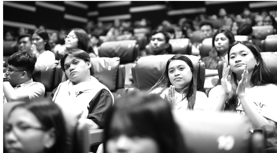
A total of 156 students and youth leaders joined the Cavite leg of GYS to participate in a daylong event filled with numerous activities, seminars, and workshops revolving around SDG 8.