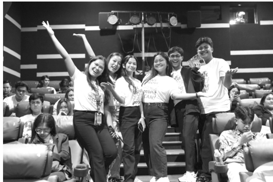
The GYS is an annual event that provides the youth with an avenue where they can share their ideas and work together to create long-term and sustainable solutions to the most pressing problems and challenges affecting them today.

To learn more, visit https://www.smsupermalls.com/smcares/ .