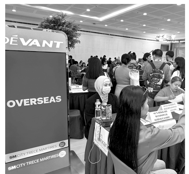
Job fair at SM City Trece Martires- City government of Trece Martires headed by the Public Employment Services Office, conducted a mega job fair which gather 90 companies consisting of local, overseas and government at SM City Trece Martires on May 22, 2024.

Publication: PMC Pulso ng Makabagong Caviteño News Publication Dates: May 27, June 3 & 10, 2024