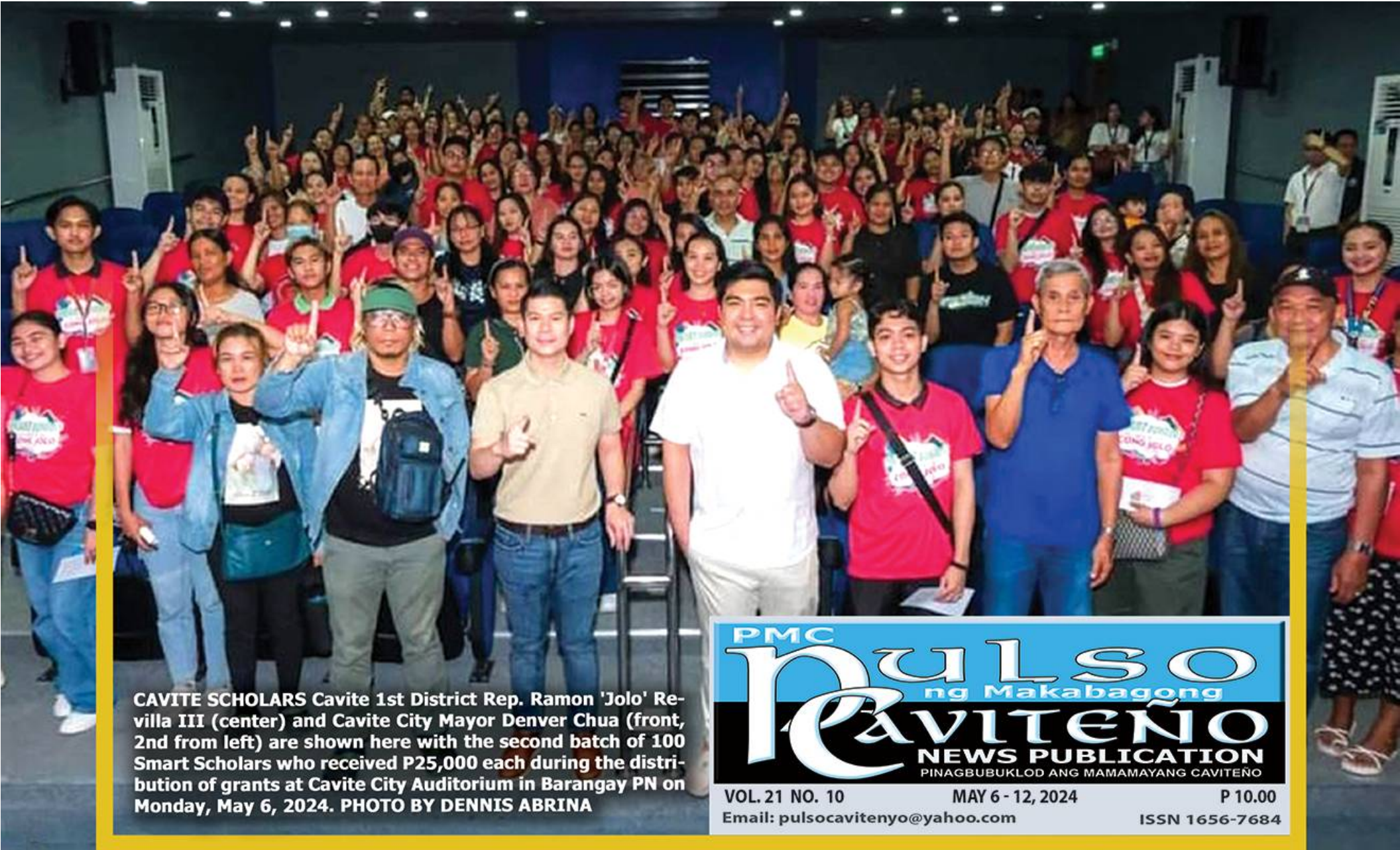
CAVITE SCHOLARS Cavite 1st District Rep. Ramon 'Jolo' Revilla III (center) and Cavite City Mayor Denver Chua (front, 2nd from left) are shown here with the second batch of 100 Smart Scholars who received P25,000 each during the distribution of grants at Cavite City Auditorium in Barangay PN on Monday, May 6, 2024.