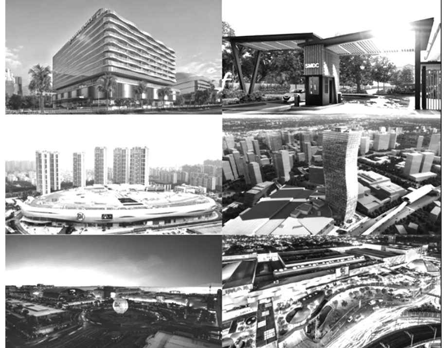
From Left to Right, Top to Bottom: Lanson Place, SM Development Corporation (SMDC) Turf Residences, SM City Yangzhou in China, SM Mega Tower, SM Mall of Asia Complex, and SM City North EDSA

SM Prime has always been committed towards creating a sustainable future. SM Prime continues to work towards its goal of achieving Net Zero carbon emissions by 2040, aligning with the Department of Energy's target of reaching a 35% renewable energy share by 2030. Through partnerships with renewable energy suppliers and organizations like the World Wildlife Fund for Nature (WWF), SM Prime endeavors to reduce its environmental footprint and advocate for sustainable practices in all ar-