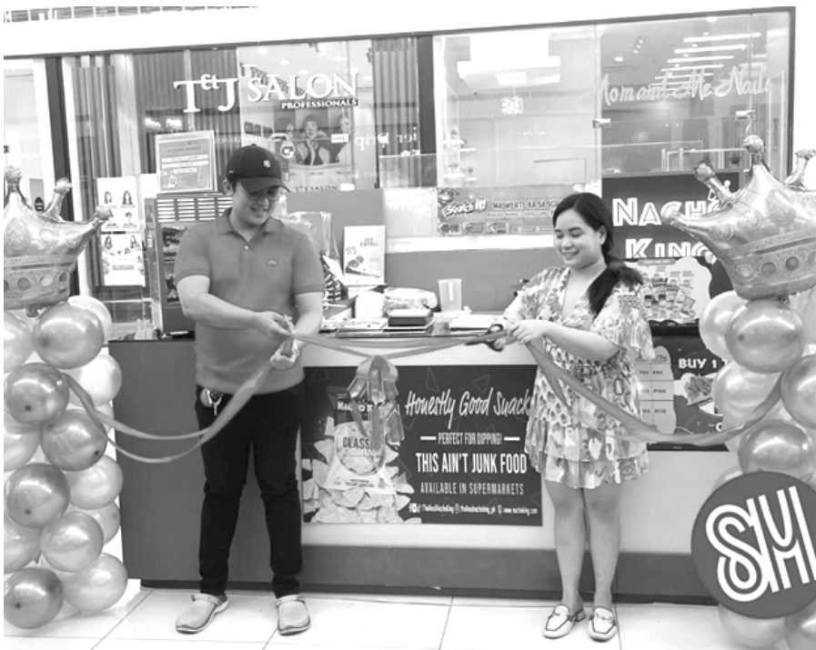
NACHO KING IS NOW OPEN AT SM CITY TANZA: The King of snacks is now at SM City Tanza! Nacho King is now serving Tanzeños the best nachos in town! Grab your meaty, cheesy and tasty nacho king at the 2nd level of SM City Tanza, near SM Cinema.

The workshop aims to gain insights into the Science, Technology, and Innovation (STI) landscape and key concerns of the participating stakeholders. The program includes the needs identification and assessment, including an analysis of problems and programs about STI initiatives. Furthermore, data gathering for Innovation Ecosystem Mapping aimed to enhance the understanding of the region's innovation landscape. As a follow-up, participants were tasked with completing Knowledge, Attitudes, Practices, and Media Preferences Assessment of Stakeholders (KAP) and Social Network Analysis (SNA) survey forms. These surveys will provide valuable insights for refining ongoing project plans and understanding the dynamics of the innovation ecosystem. (By Sydney Mae Tadiosa)