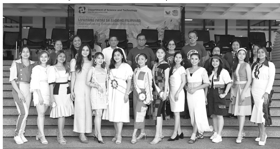
DOST Lakambinis proudly and confidently wear the attire made of Philippine Tropical Fabrics created and produced by the DOST-Philippine Textile Research Institute (DOST-PTRI).

In the kick-off activity, the parade was followed by the opening program that included the presentation of DOST agencies' Lakambinis and floats, as well as the turnover ceremony of 'Silyang Pinoy' that consists of 12 sets of tables and chairs for the DOST Day Care Center. Other activities in the whole-day celebration that promote and advocate gender equality were the following: Mini Bazaar, Palarong Pinoy, Wellness, Free Legal Assistance, and AI Fresco Entertainment, which were organized by the DOST Central Office (DOST CO) and DOST-Research and Development Institutes (DOST RDIs). (By Rhea Mae B. Ruba, DOST Media Service)