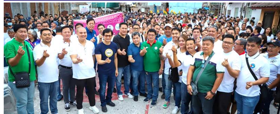
KAWIT, Cavite (PIA) – Interior Secretary Benjamin C. Abalos, Jr. on Feb. 24, led the Kalinisan at Inisyatiba para sa Malinis ng Bayan (Kalinisan) program conducted in Barangay Samala-Marquez in Kawit, Cavite.