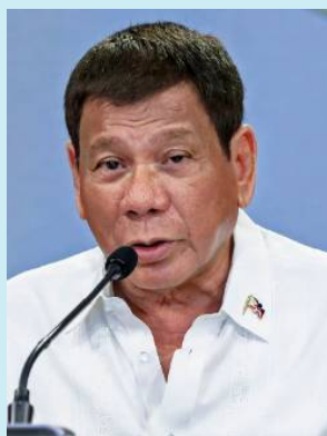
EX-President Rodrigo Roa Duterte

EX-PRESIDENT Rodrigo Roa Duterte is the man to beat in the 2025 Senate race, as he was picked out by various farmers' groups among the senatorial bets for the forthcoming midterm elections.