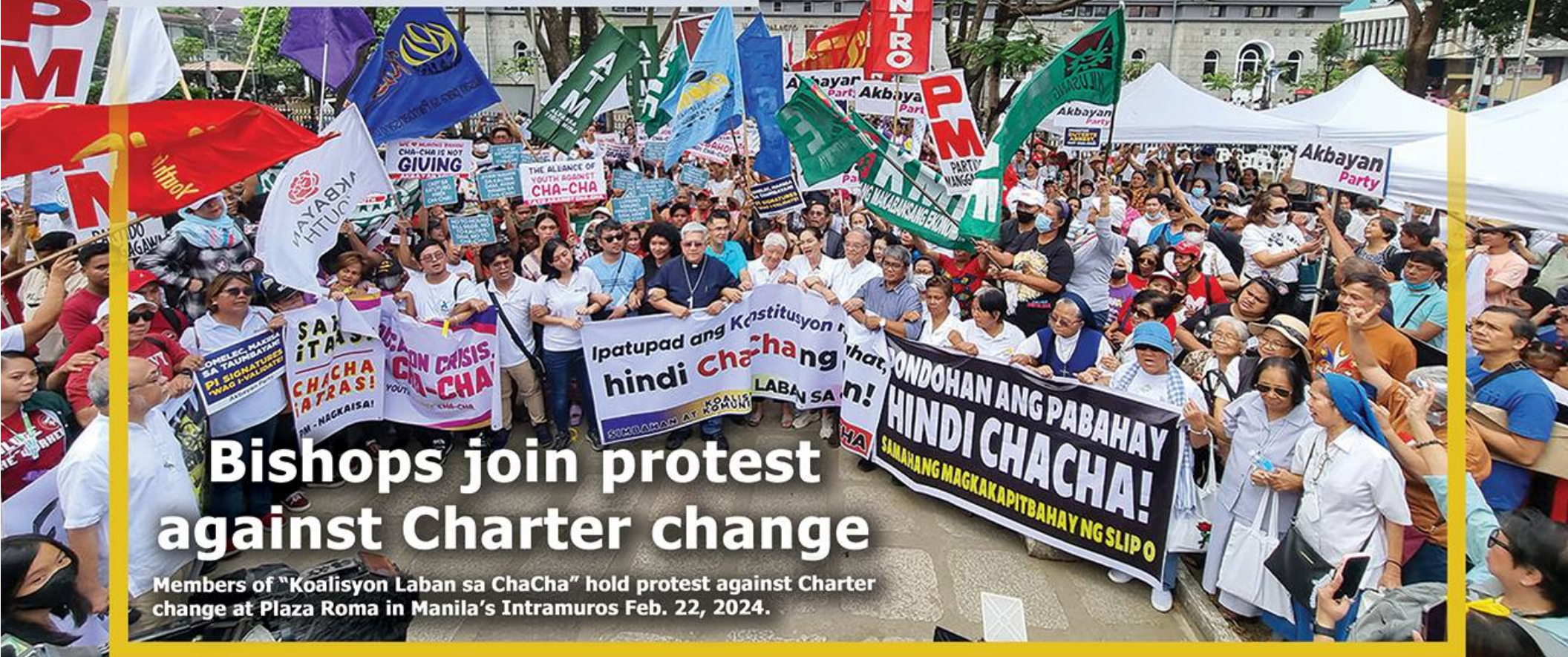
Bishops join protest against Charter change Members of "Koalisyon Laban sa ChaCha" hold protest against Charter change at Plaza Roma in Manila's Intramuros Feb. 22, 2024.