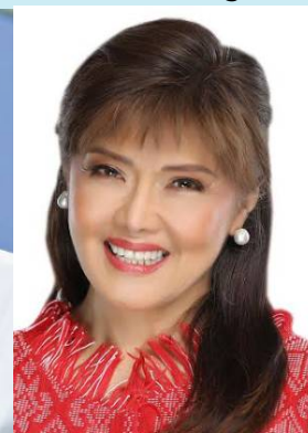
Sen. Imee Marcos