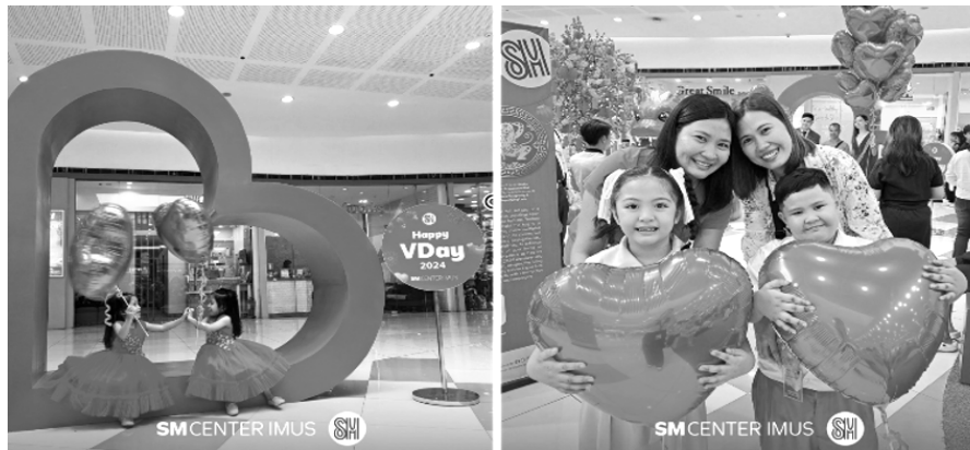
Double the hearts, double the love at SM Center Imus! Shoppers enjoy taking photos at the Valentines Display at SM Center Imus.