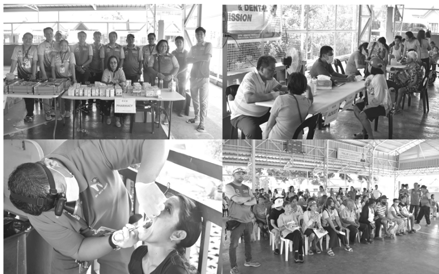
On February 20, 2024, the Office of the Provincial Governor - Medical Mission Team, in partnership with the Office of the Provincial Health Officer, led a compassionate health service initiative at Barangay Bucandala I, City of Imus. Three hundred seventy-one (371) patients received free medical consultations, while 50 individuals underwent free tooth extractions. All the beneficiaries who availed of the medical and dental services also received free prescription medicines. (OPIO)

This partnership will endeavor the creation of the province's RE road map, which will define areas for investment. The province targets six months from the MOU signing towards the holding of the RE and Investments Summit which will be attended by local and foreign RE investors and developers.