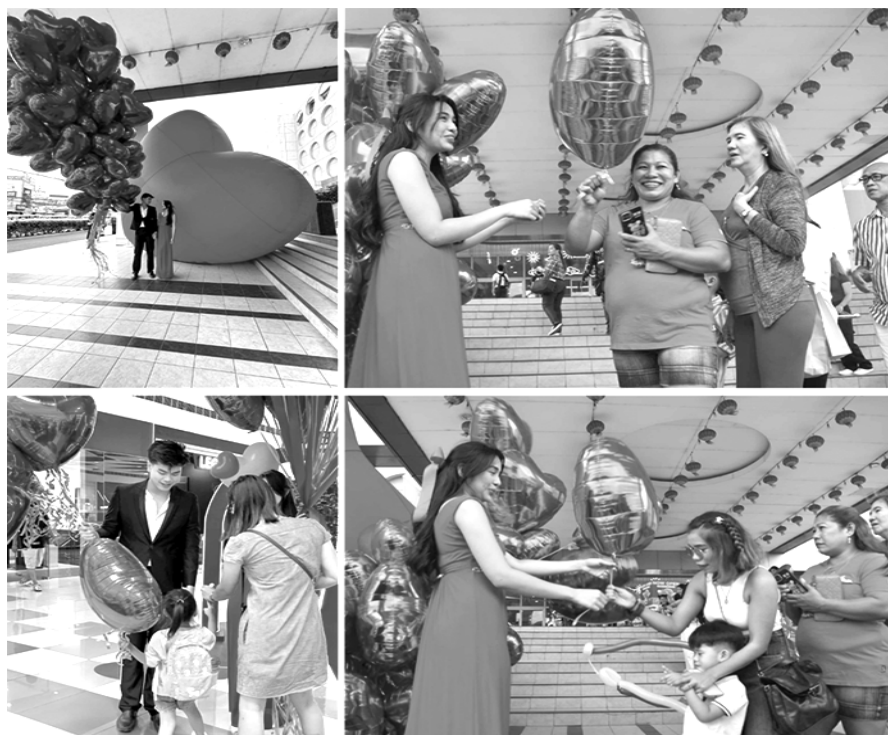
Shoppers receive big heart balloons and pose at the giant heart as they celebrate Valentines together with their love ones at SM City Bacoor