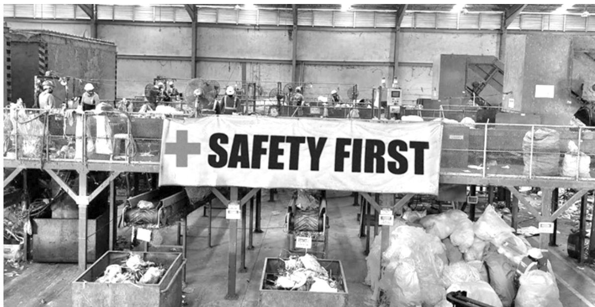
SM Prime joins forces with GUUN to develop infrastructure for waste management, aiming to minimize landfill impact across SM Prime and non-SM Prime properties.

tainable waste management practices. She said, "The DENR continues to collaborate with development partners and the private sector in tackling the challenge of solid waste management. Implementing industrial-scale, appropriate transition technologies for segregation and processing is a crucial step toward achieving a circular economy. Partnerships like the one between SM Prime and GUUN play a vital role in shaping a sustainable future."