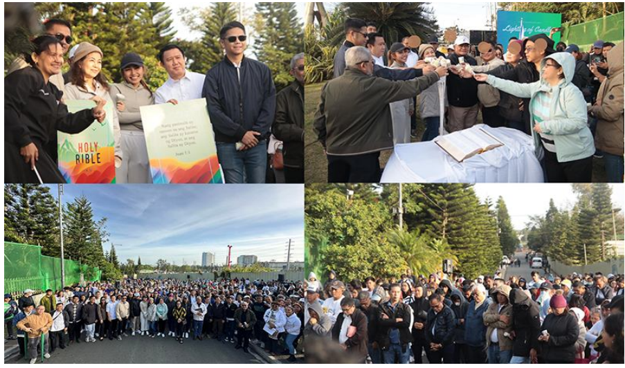
In a serene and spiritually charged atmosphere, the province of Cavite reverberated with prayers, inspiration, and unity during the National Bible Awareness Month Celebration held on January 27, 2024, at the iconic Praying Hands in Tagaytay City.

Bible Month Celebration Unveils Spiritual Unity in Cavite