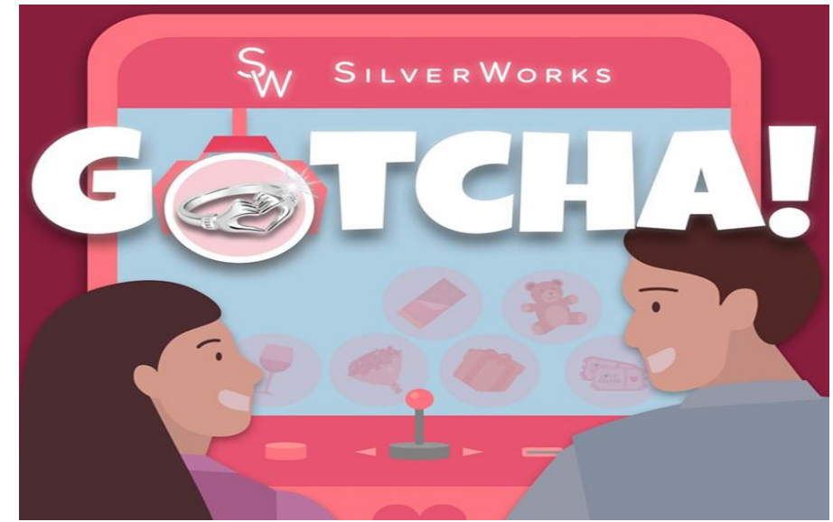
SILVERWORKS – SM CITY BACOOR GOTCHA FOR VALENTINES! SM CITY BACOOR, CAVITE - Want fun, exciting surprises that never go out of style? We GOTCHA! Visit the SilverWorks store at the Lower Ground Level of SM City Bacoor and grab the jewels you need for Valentines. New designs await you!

During the 20th Philippine Quill Awarding Ceremony on January 23, 2024, held at Marriott Grand Ballroom, Pasay City, MPT South's 2022 Calendar titled 'Homegrown Heroes' earned the Quill Award of Merit. This corporate calendar showcased the heroism of both internal employees and external individuals during the pandemic. MPT SOUTH • 7