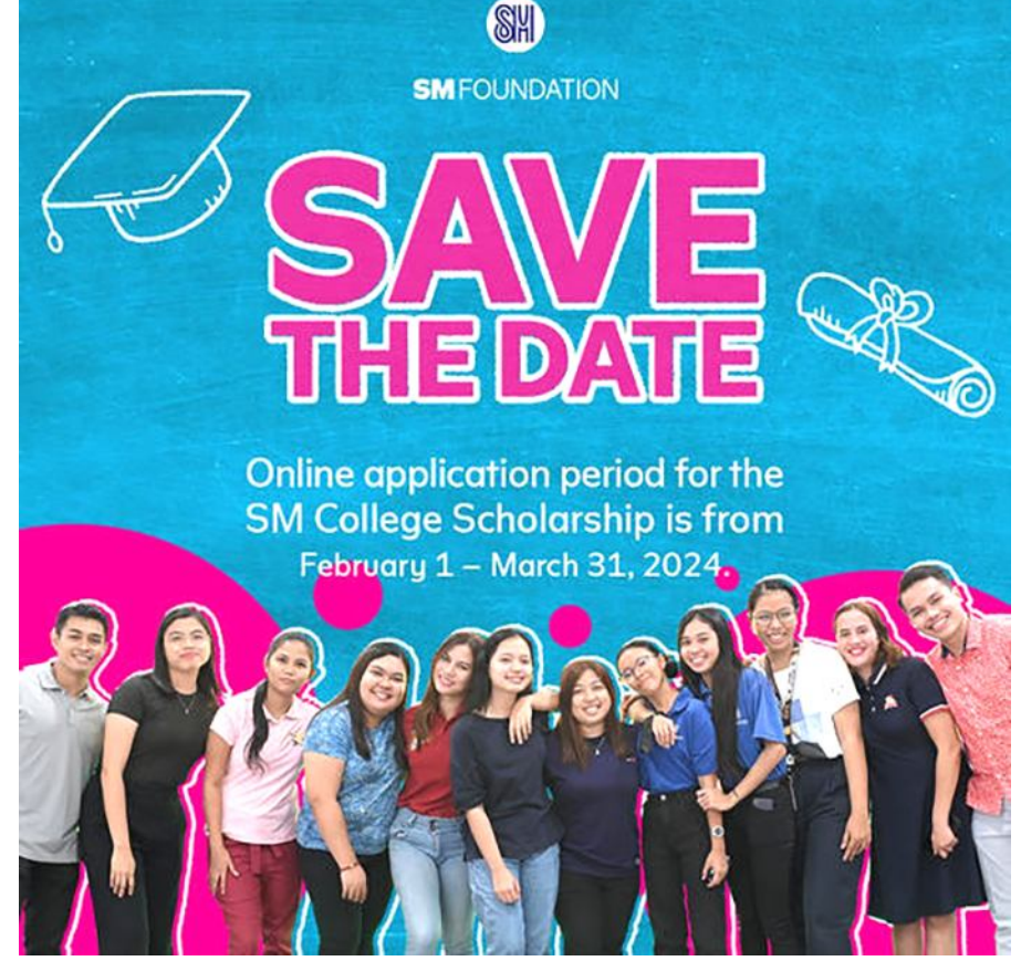
Calling all aspiring scholars! The SM Foundation College Scholarship application is just around the corner. The online application for incoming college freshmen is open from February 1-March 31, 2024. Visit www.smfoundation.org for more details. #SpreadingSocialGood #SMScholar