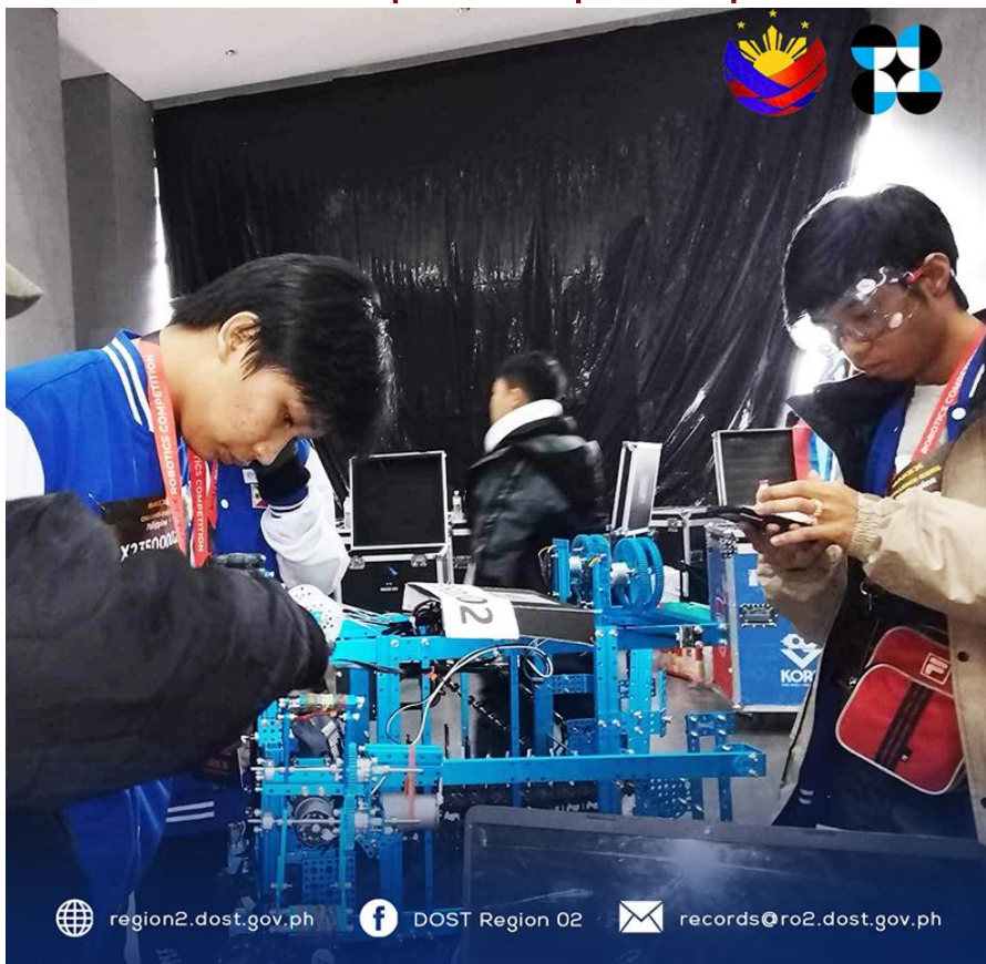
TUGUEGARAO City Science High School (TCSHS) Robotics team garnered third place in the MakeX robotics challenge category held in Yantai, China, last December 8–11, 2023.

The team demonstrated exceptional talent and innovation on the global stage, according to school officials. The international robotics competition was joined by more than 30 countries around the globe to promote multidisciplinary learning in the fields of science and technology.