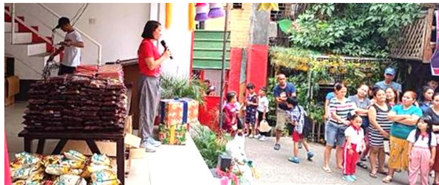
National Books Store Foundation with Bayan Ni Juan and DOST gives Oishi snacks and NBS Notebooks to students from Daang Hari Elementary School.