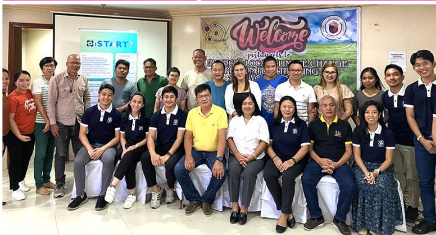
In pursuit of fostering climate-resilient communities nationwide, the Department of Science and Technology backs LGU Kadingilan in the formulation of their Enhanced Local Climate Change Adaptation Plan at Pearlmont Hotel, Cagayan de Oro City.

Through the agency's Innovation, Science, and Technology for Accelerating Regional Technology-based Development (iSTART) Program, LGU Kadingilan has produced an enhanced LCCAP on November 29 to December 2, highlighting sustainable, science, and technology-driven solutions to address climate change challenges in the municipality.