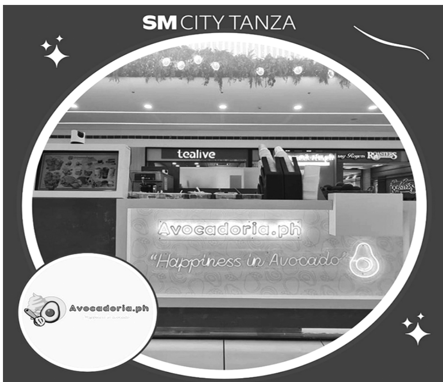
Happiness in a cup of Avocadoria SM City Tanza: A refreshing escape to green paradise in every cup of Avocadoria! What a healthy and a yummy dessert snack to choose! Visit Avocadoria, located at Ground Level.