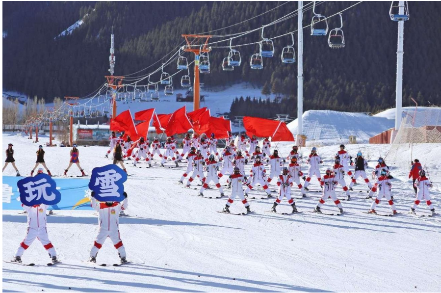
The 21st Silk Road Ice and Snow Festival in Urumqi kicks off in northwest China's Xinjiang Uygur autonomous region. Photo shows a skiing performance staged during the opening ceremony of the event.

Leveraging its abundant ice-and-snow resources, Xinjiang Uygur autonomous region in northwest China has developed new business forms and products, and fostered new advantages of its ice-snow industry in recent years. More and more people to experience the charm of the ice and snow leisure tourism.