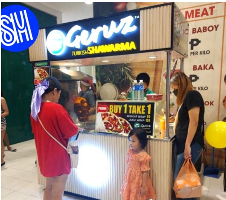
New shawarma experience at SM Marketmall: Get your taste buds on fleek! Geruz is now firing up their stall at SM Marketmall Dasmariñas! Visit Geruz Turkish Shawarma at SM Marketmall and roll through for the ultimate shawarma experience!