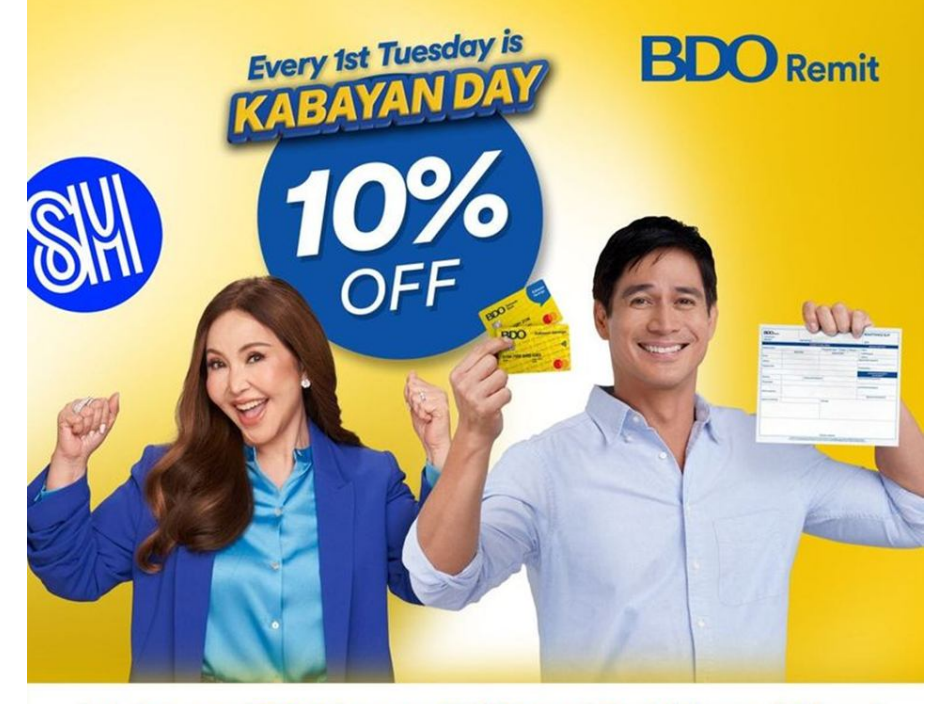
Just show your BDO Kabayan or BDO Network Bank Kabayan ATM card or passbook or remittance payment slip.

Brown is making a comeback. Not that it has ever left... but brown has been a staple in interior design for as long as people can say warm and earthy. This year though, brown captures the imagination of interior design as it embraces the luxurious side of brown. For 2024, brown evolves into something sophisticated and elegant as exemplified by plush brown fabrics in furniture upholstery, bed linens and throw pillows. Shades and tones of brown come alive in different gradations as it evokes a neutral appeal. Cinnamon, burnt sienna, chocolate, camel and sand with its tones and shades all give rise to a new look in furniture and furnishings. So why is brown the new black? Because in TOP INTERIOR • 2