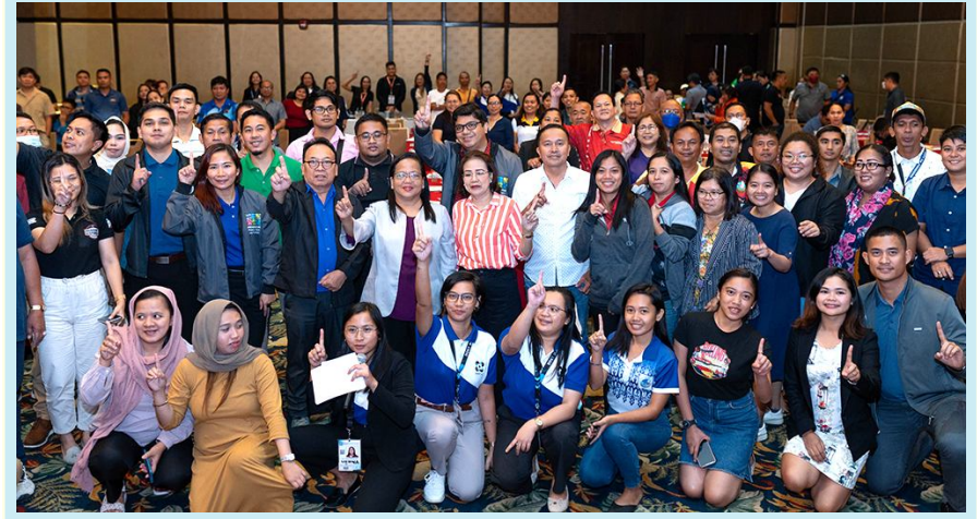
The Department of Science and Technology in region 10, in partnership with its attached agencies, DOST PAGASA and DOST PHIVOLCS, bring MAGHANDA Forum to LGU Information officers and media professionals in Cagayan de Oro City. The activity became a vital conduit for sharing knowledge and expertise essential for comprehensive risk assessment, mitigation, and preparedness.

More than 150 local government units and various communication groups enhance disaster communication skills through the recently conducted DOST-led forum, "MAGHANDA: Communicating Hazards, Risks, and Early Warning Forum."