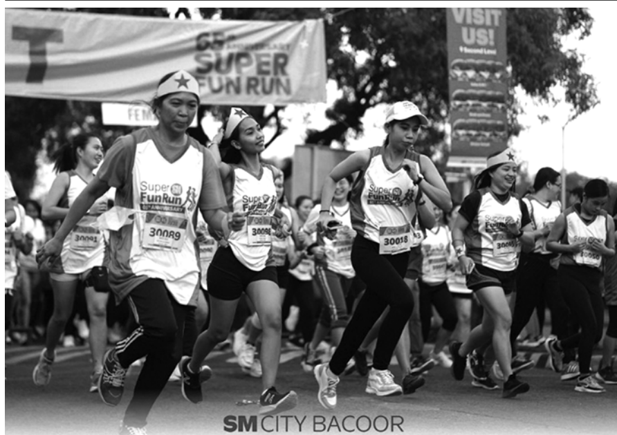
SM CITY BACOOOR

BACOOOR, CAVITE – In celebration of SM's 65th anniversary, SM City Bacoor and SM City Molino came together with a burst of energy, unity, and a strong sense of community in their first ever Fun Run. More than 200 employees from the two malls raced around SM City Bacoor's perimeter in two sets, a 3KM track for female racers and 6KM for the male runners.