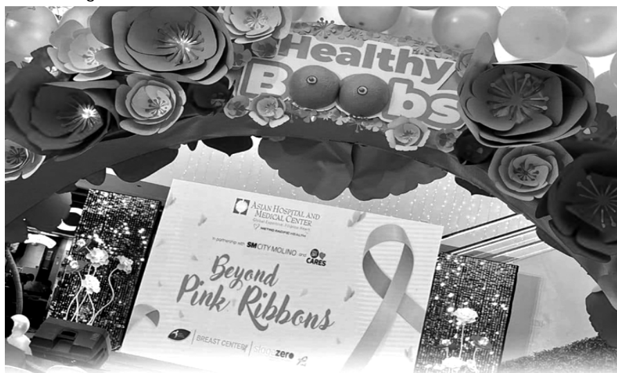
SM CITY MOLINO