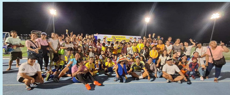
The Imus City Football Academy and Community

What made this festival a massive hit was the active involvement of parents. They took on various roles – coaches, medics, food providers, photographers, videographers, and passionate fans. Their dedication underscored the vital support families provide and added a unique flavor to the event, strengthening the bonds between players and their loved ones.