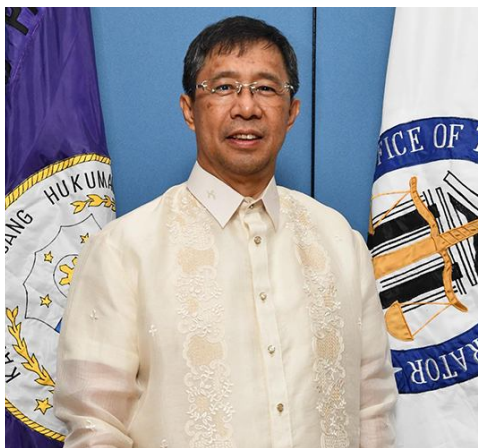
HON. RAUL B. VILLANUEVA