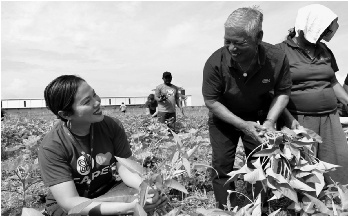
SM Supermalls employees join the harvest festival in Tanza, Cavite.

The program, Kabalikat sa Kabuhayan on Sustainable Agriculture Program (KSK-SAP), aims to help marginalized farmers in the Philippines improve their farming practices and economic opportunities.