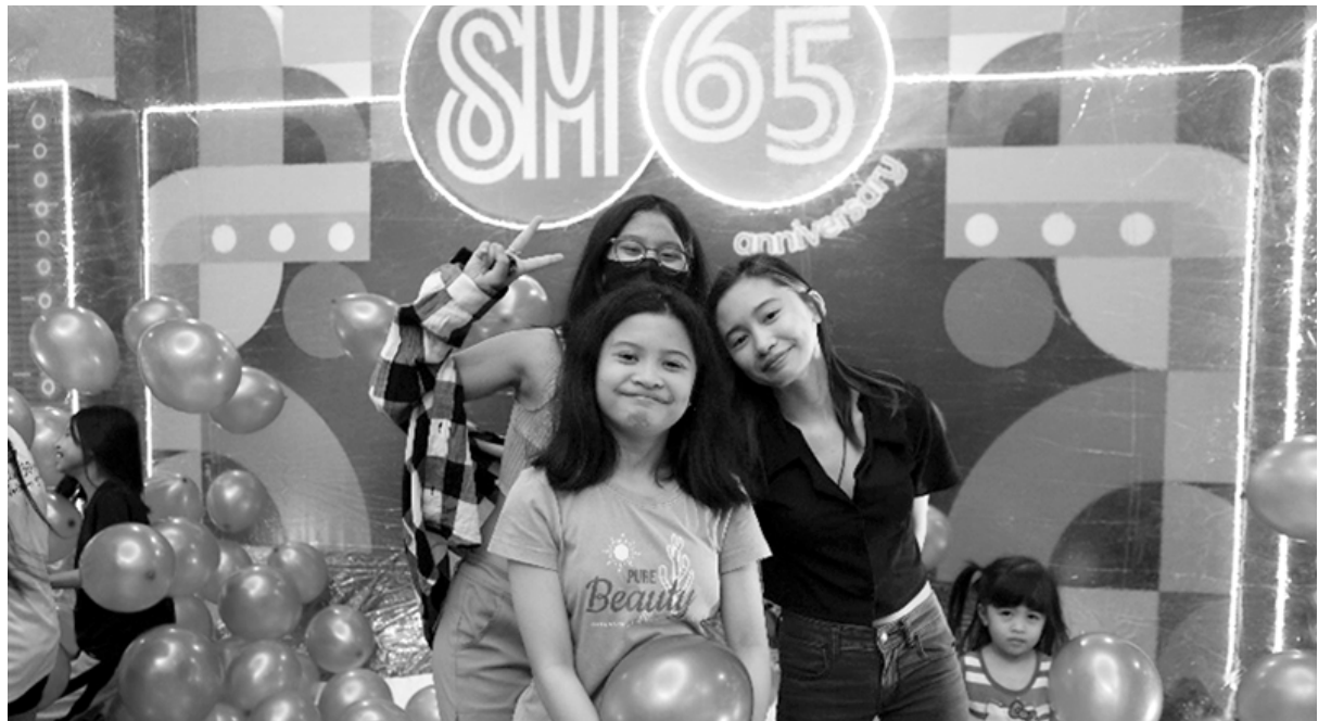
65th BUBBLE PLAY SPOT! A Level-up fun and exciting mall experience at SM City Dasmaringas: As SM Supermalls celebrate its 65th year anniversary, mall experience has amplified to creating a different level of fun for shoppers, families and friends. Snap that smile and capture those great moments with them at the ecstatic and astounding bubble play spot SM City Dasmaringas has set up for you! Come and experience that awSMe vibe at the event center, lower ground floor of SM City Dasmaringas. For more details, please visit SM City Dasmaringas Facebook page.

Publication: PMC Pulso ng Makabagong Caviteño News Publication Dates: October 16, 2023