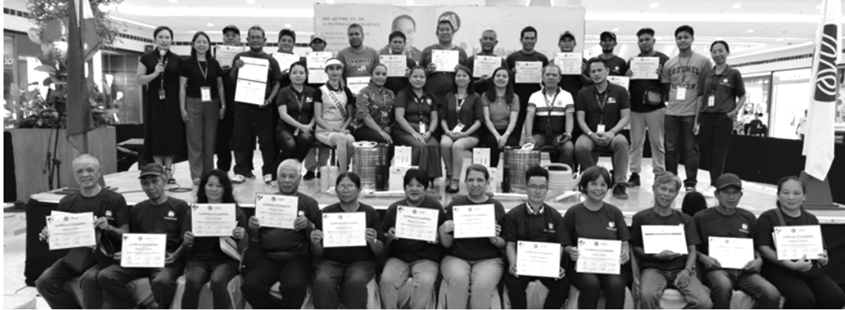
Graduation of KSK-SAP Batch 260 in SM City Tanza

The SM Foundation recently marked the graduation of farmers who completed a 14-week training program in modern agricultural methods.