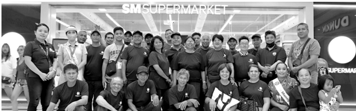
KSK-SAP farmers in SM Supermarket in SM City Tanza