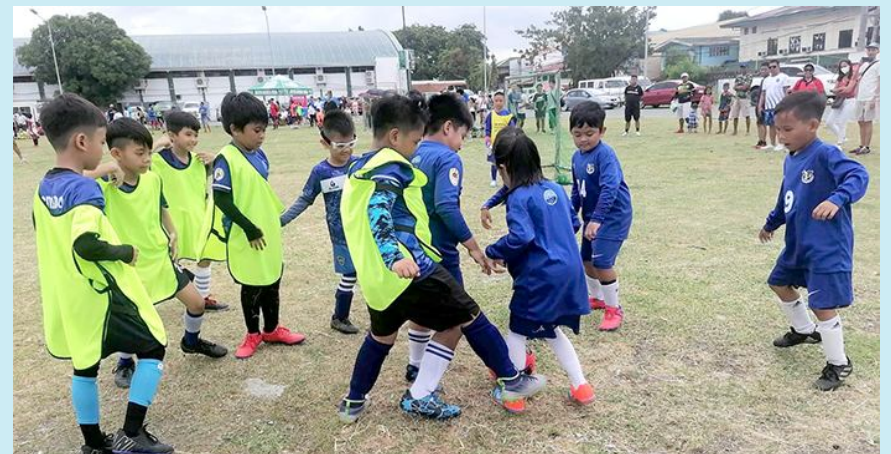
(Imus United Football Club 8 and Under Team in action)