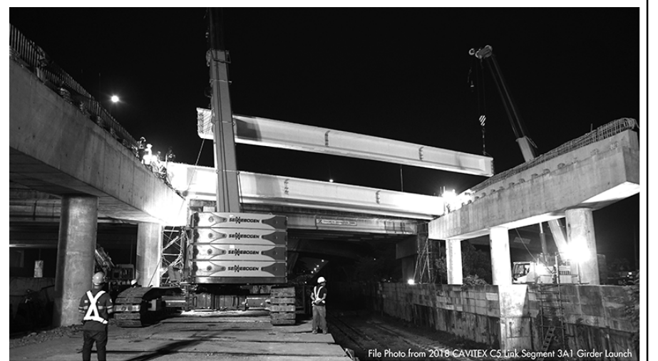
File Photo from 2018 CAVITEX C5 Link Segment 3A1 Girder Launch

CIC is a subsidiary of Metro Pacific Tollways Corporation (MPTC) - the leading mobility infrastructure and solutions provider in the Philippines. It is the toll road development arm of Metro Pacific Investments Corporation (MPIC). Aside from CAVITEX and CAVITEX C5 Link, MPTC