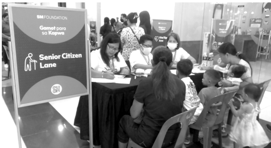
Around 500 residents of Rosario, Cavite received free medical services such as blood test, ECG, consultation, free medicines and dental services from the recently concluded medical mission of SM Foundation's Gamot para sa Kapwa project at SM City Rosario.