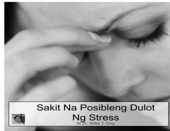
Sakit Na Posibleng Dulot Ng Stress Ni Dr. Willie T. Ong

8. Kumonsulta sa doktor - Dapat ding magpatingin sa doktor para masuri kung stress nga ba ang dahilan ng iyong nararamdaman. Baka may iba palang sanhi. Good luck po.