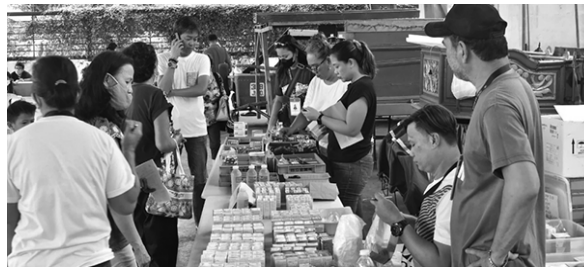
Prioritizing the wellness of Imuseños. The Provincial Government of Cavite, through the Office of the Provincial Governor-Extension and Office of the Provincial Health Officer, assessed the wellness of its constituents in another health outreach program conducted at Brgy. Malagasang 11-D, City of Imus, on August 12, 2023. Medical practitioners from OPHO and Dr. Olivia Salamanca Memorial District Hospital teamed up to attend to the basic medical concerns of 459 patients, where they rendered actual consultation and provided healthcare advices. Afterwards, OPG-Extension personnel handed out medicines, vitamin supplements and insect repellent lotion free of cost to ease the financial worries of the residents, especially those in the grassroots level. With the assistance of Barangay officials, health workers and volunteers, the medical mission program was a resounding success.

Proclamation No. 1761, s. 1978 declared August as National Lung Month to increase public awareness among Filipinos about common pulmonary conditions and the importance of maintaining healthy lungs for a better lifestyle. (AM, PIA-4A/ with reports from PIA Cavite)