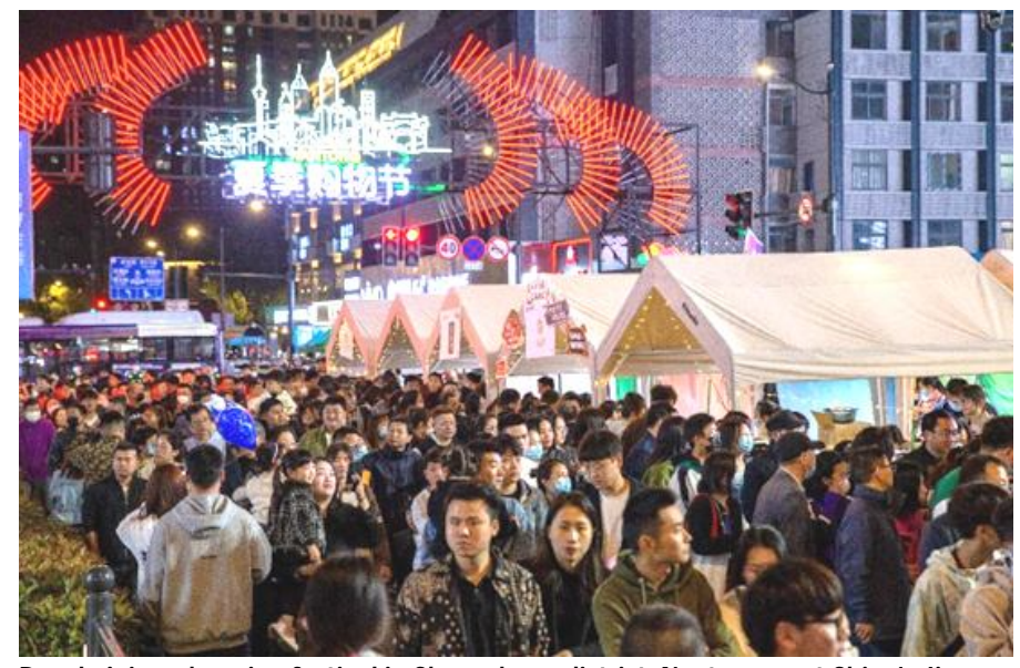
People join a shopping festival in Chongchuan district, Nantong, east China's Jiangsu province.

This year, a number of new products have been launched in various sectors of the consumption market, including Huawei's P60 smartphone, the Blossoms Collection perfume of Jo Malone, collaboration T-shirts of UNIQLO, as well as new vehicle models by Chinese carmakers BYD, GAC Group and NIO.