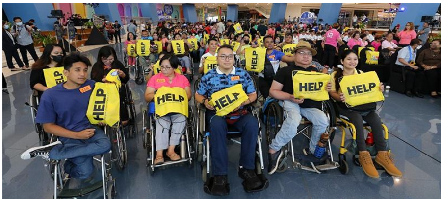
Delegates from Tahanang Walang Hagdan, Inc.