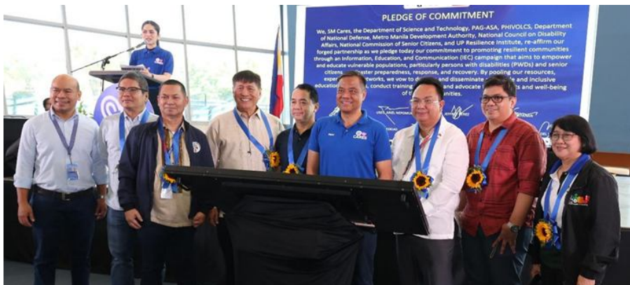
Photo highlights during the Emergency Preparedness Forum on July 5, 2023

In celebration of National Disaster Resilience Month, SM Cares recently launched this year's Emergency Preparedness Forum for senior citizens and persons with disabilities (PWDs). The first of eight forums was held last July 5, Wednesday, at the SM Mall of Asia Music Hall in Pasay City.