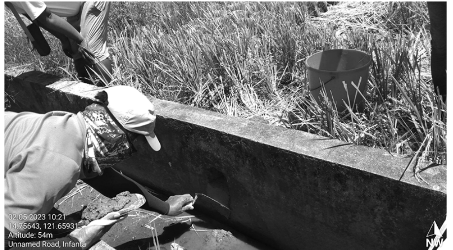
NIA personnel has started inspecting irrigation sites to make sure water resources are used efficiently during periods of low rainfall.

"Malaking tulong po itong ating AWD para magkaroon tayo ng kaalaman sa tamang paggamit ng ating tubig. Ito ay makakatulong sa