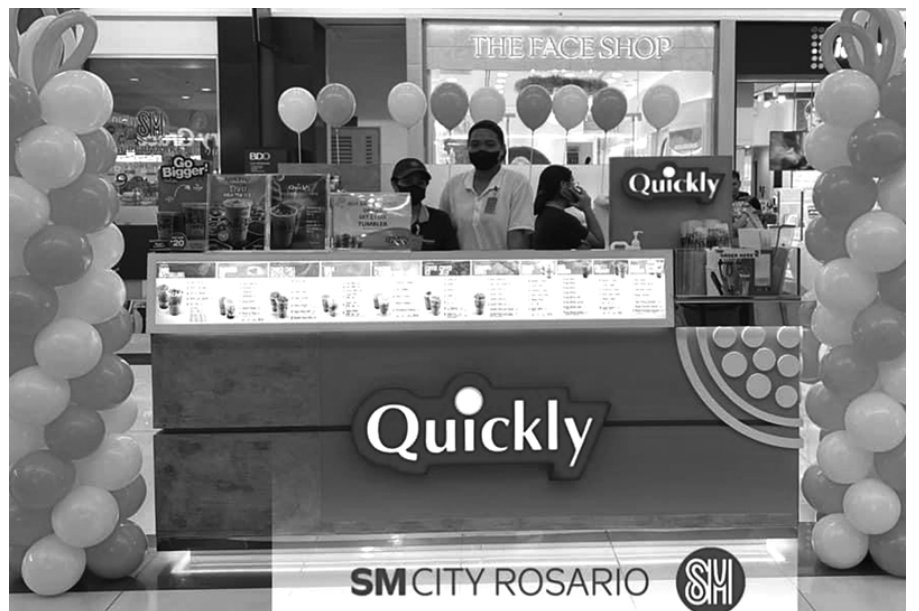
Quickly SM City Rosario is now open! Try out now their delicious and refreshing drinks. Located at Lower Level so you can easily drop by and grab your favorite drink anytime.