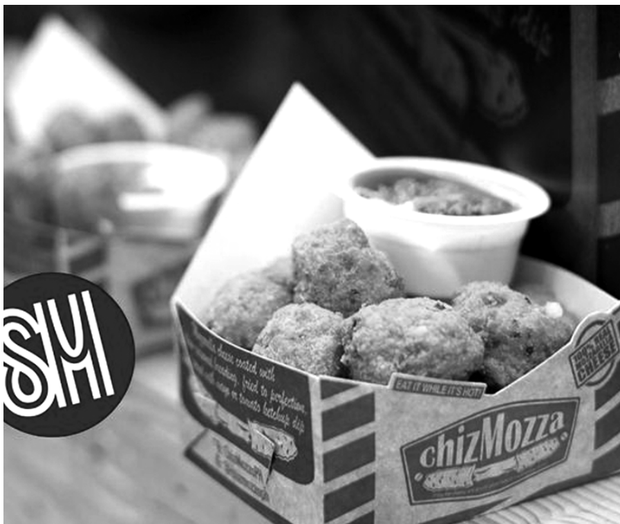
TREAT YOURSELF AT CHIZMOZZA – SM CITY BACOR, CAVITE – Indulge yourself in mozzarella bites - the perfect crispy and cheesy treat to satisfy your cravings. Go ahead and treat yourself with cheezy treats at Chizmozza located at the FoodCourt, 4th level of SM City Bacoor.

A slight decline in production and lower imports due to rising international prices is possible but supply in general will be stable while end-year stocks may be lower, Pagasa added. (CH/PIA-Laguna)