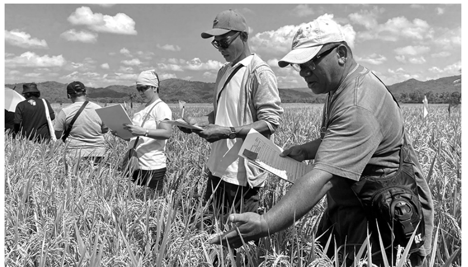
DA IV-A personnel conducts preferential analysis of different varieties of palay in Santa Maria, Laguna to prepare for the effects of El Niño.