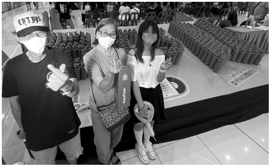
Grandparents support K-Pop fandom of their GenZ granddaughter and took a photo with her at BTS AquaFlask art installation.

Annyeonghaseyo! K-Pop nation shouted it loud as SM City Tanza brought an aweSM night of fun with songs and dances by BTS and SEVENTEEN!