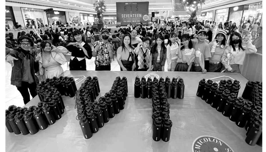
Armys and Carats in their K-Pop outfit posed at the SVT AquaFlask Installation at SM City Tanza during the BTS x Seventeen K-Pop night.

amassed using 1,400 AquaFlask thermal bottles. K-Pop generation compliments AquaFlask's advanced and innovative design and technology that makes it top 1 thermal bottle in the Philippines.