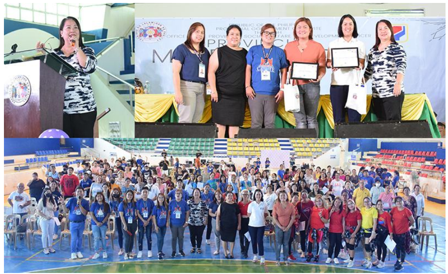
In recognition of the significant contributions and the many sacrifices of Caviteño migrant workers as they strive overseas to provide for their families, the Office of the Provincial Social Welfare and Development Officer and the Cavite Overseas Filipino Welfare Council spearheaded the Provincial Migrant's Day Celebration at the Provincial Gymnasium in Trece Martires City on June 17, 2023.