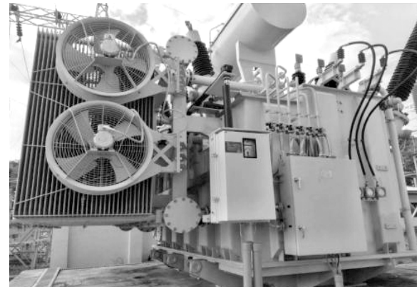
Old and aging power transformers installed pre-privatization were replaced with new equipment like this 100MVA transformer in Olongapo Substation.

Since taking over transmission operations in 2009, NGCP invested PhP3.289 Billion in upgrades across 15 of its substations and converter stations in Taytay, Binan, Quezon, Abaga, Mexico, San Jose, Sucat, Compostela, Davao, Ormoc, Naga, Araneta, Agus 2, Calaca, Agus 6, and Tiwi A and C. These improvements cater to the increasing load