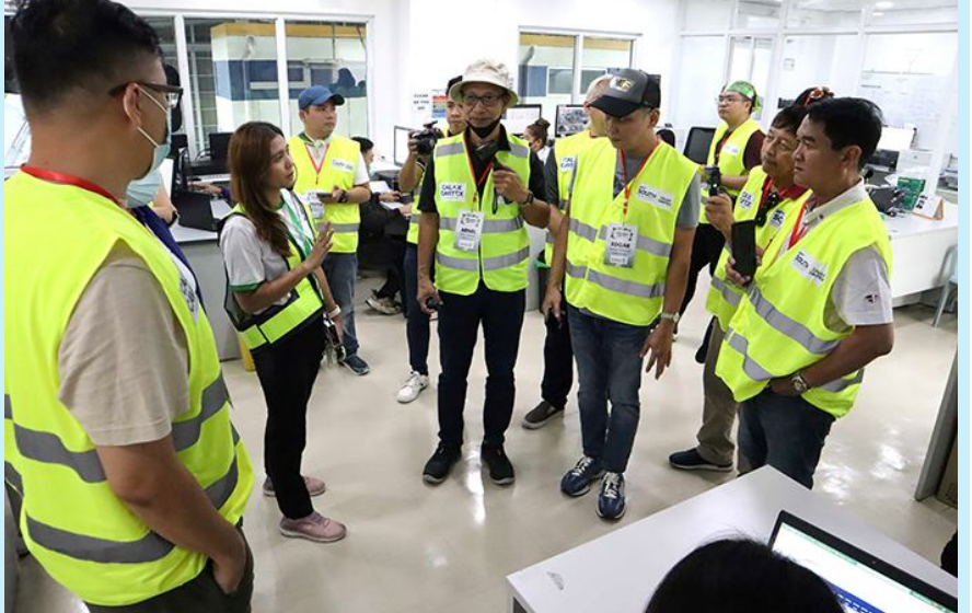
In partnership with Acienda Designer Outlet and Henry's Cameras, the toll road company embarked on an exclusive tour, accompanying media partners to explore both the current operational and the soon-to-open section of the Cavite-Laguna Expressway (CALAX)- the Silang (Aguinaldo) Interchange or Subsection 4. During the visit, MPT South showcased its dedication to innovation and green technology by highlighting energy-efficient equipment along CALAX. The operational sections of CALAX feature toll plazas equipped with solar panels, generating power for their own operations. LED fixtures are installed in both lighting and roadway systems, enhancing energy efficiency and sustainability measures throughout the com- MPT SOUTH • 7