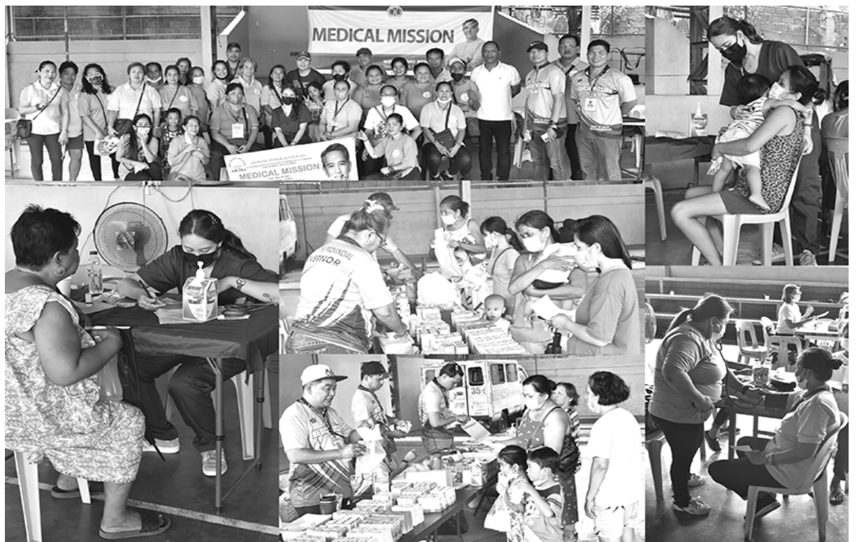
A life-saving medical mission amidst unpredictable weather. In the midst of unpredictable weather, a medical mission headed by the Office of the Provincial Governor-Extension and Provincial Health Office (PHO) in cooperation with Abot Kamay ng Masa (AKMA), a non-government organization, was conducted in Barangay San Dionisio, City of Dasmariñas on May 30, 2023. Undeterred by the wind and imminent rain, the team set up a makeshift clinic in a covered court, determined to bring hope and healing. They successfully treated a range of ailments and provided medicines to almost 300 patients. Their unwavering commitment showcased the power of compassion and resilience.--- PICAD

Publication: PMC Pulso ng Makabagong Caviteño News Publication Dates: May 29, June 5 & 12, 2023