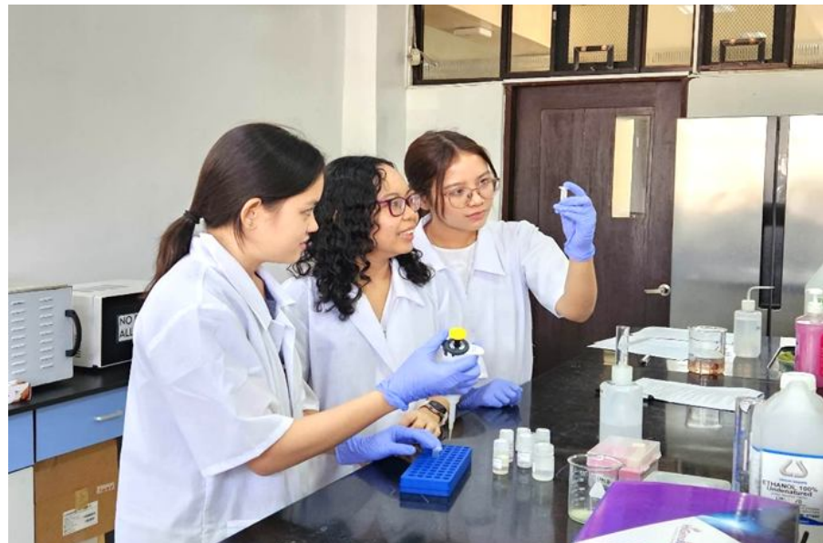
DNA extraction from thermophilic bacteria

The researchers suggest further microbial and natural product (NP) exploration of volcanoes and hot springs - underexplored habitats - that will undoubtedly yield a huge repertoire of novel and biologically active compounds.