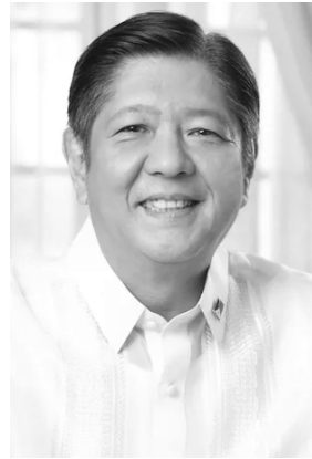
President Bongbong Marcos

"Whereas if you are locally-based, then you are competing with other local domestic industries and therefore you should