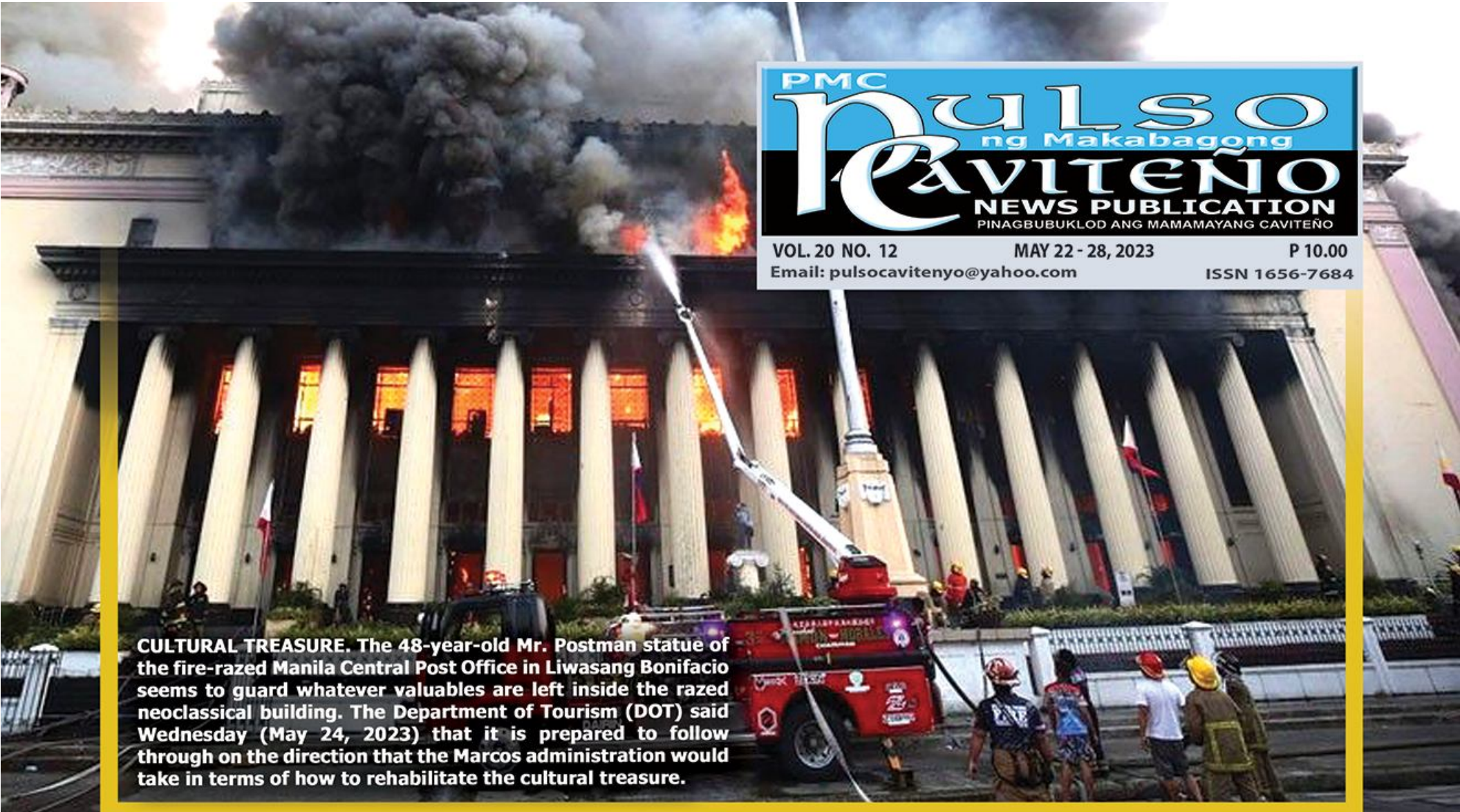
CULTURAL TREASURE. The 48-year-old Mr. Postman statue of the fire-razed Manila Central Post Office in Liwasang Bonifacio seems to guard whatever valuables are left inside the razed neoclassical building. The Department of Tourism (DOT) said Wednesday (May 24, 2023) that it is prepared to follow through on the direction that the Marcos administration would take in terms of how to rehabilitate the cultural treasure.